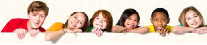
Children 5-17 years old