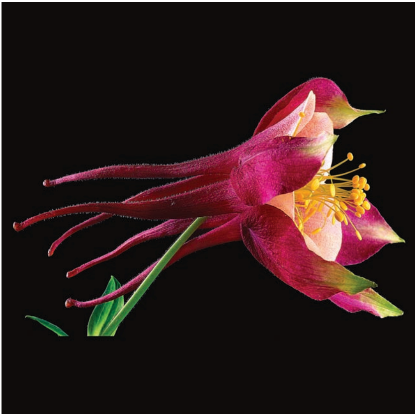
Jon Walton Photography Studio 5