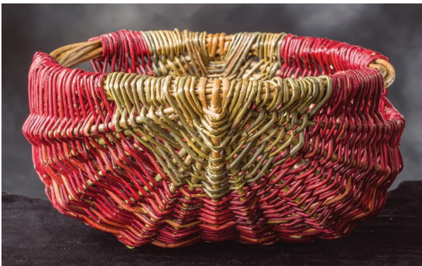
Elise Thornton Woven Willow and Bark Baskets Studio 1