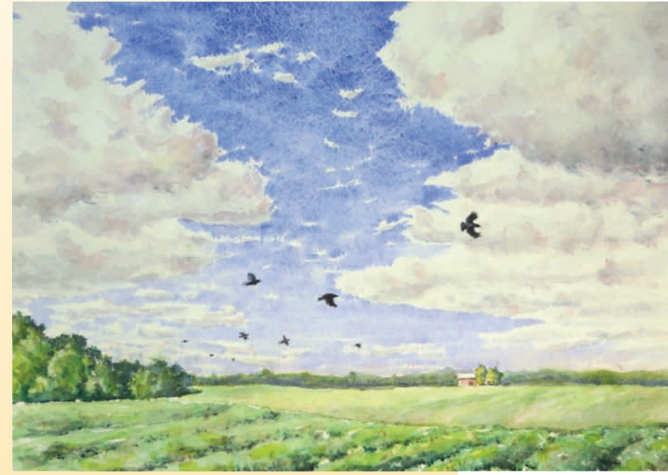
James McKnight Watercolor on paper Studio 8*