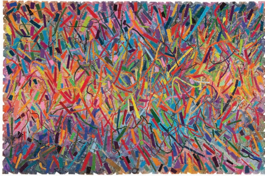
Pat Kroth Fiber Art Studio 7