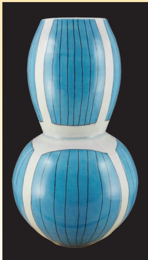
Neil Estrick Ceramics Studio 4