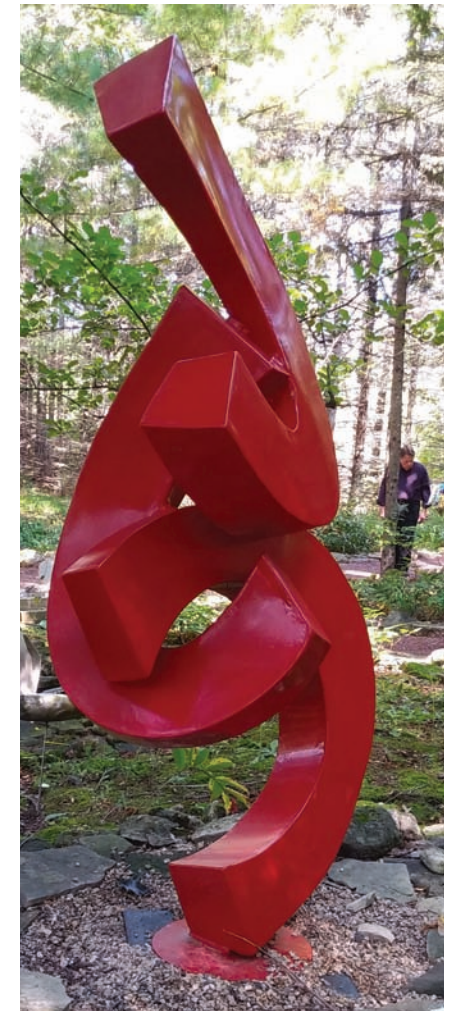
Curtis Archer Metal Studio 2*