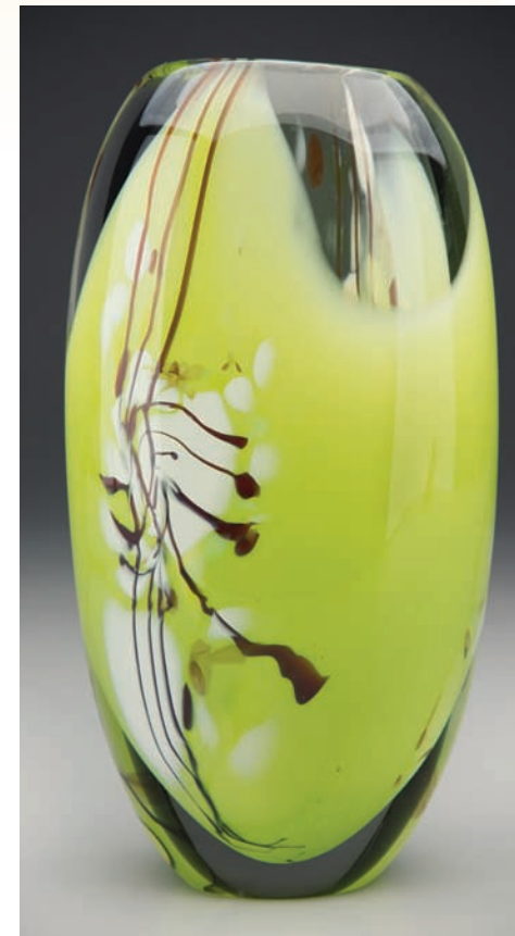
Sharon Fujimoto* Blown Glass Studio 5*