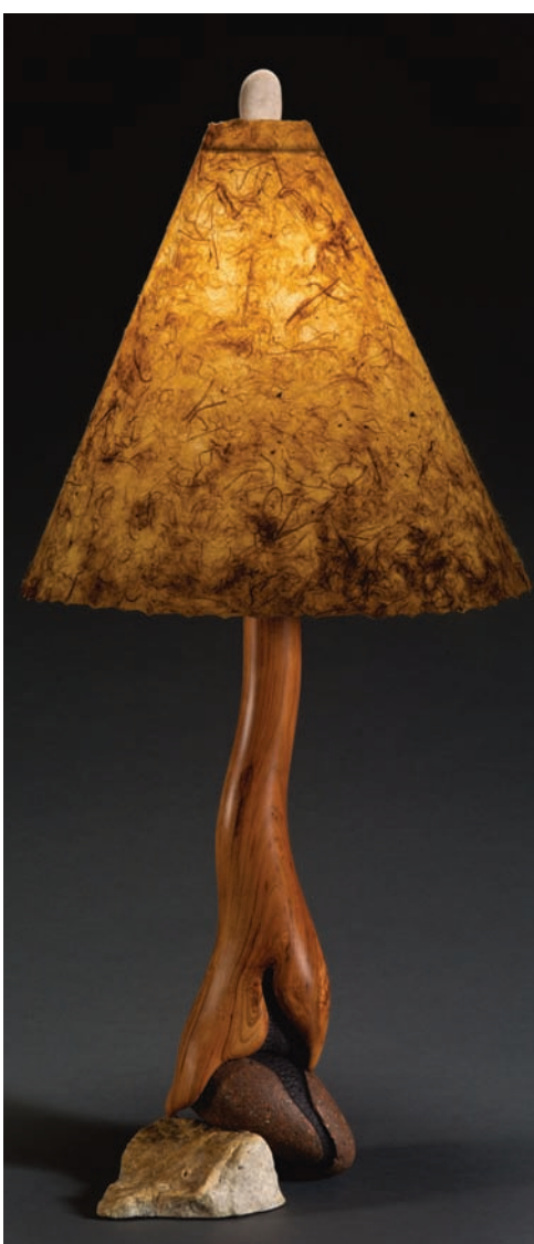
Paul Klein Sculptural Lighting Studio 7*