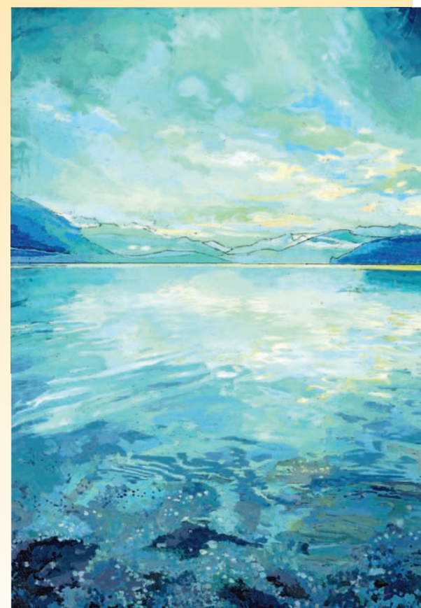
Jessie Fritsch Encaustic Painting Studio 2