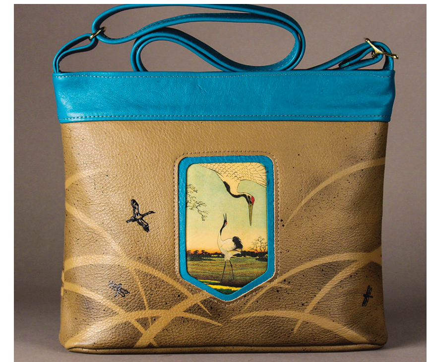
Pamela Bronk Leather Handbags Studio 1