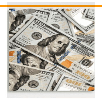
Return of the Crying Towel Members names drawn for the Jackpot Not Present to win $100.00 3/06/2024 James Lyman 3/13/2024 Laurence P Glynn 3/20/2024 Don Myers 3/27/2024 Installation