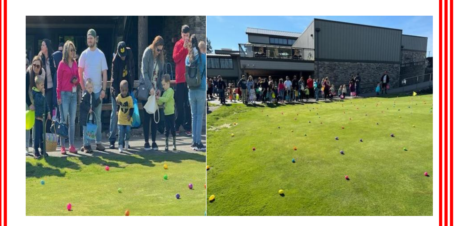
Easter 2024 Two Easters in one Lodge year