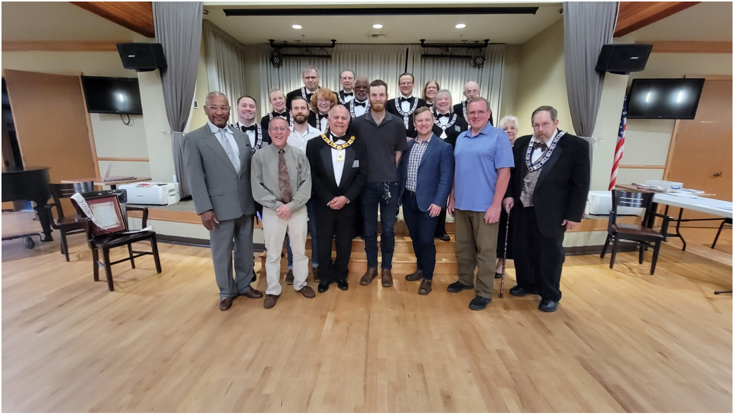
June 8th Initiation