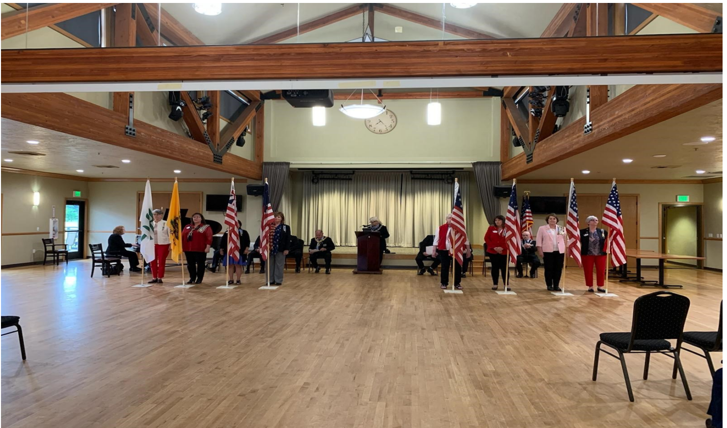
June 14th Flag Day Ceremony