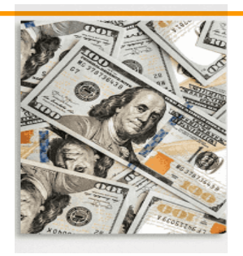
Return of the Crying Towel Members names drawn for the Jackpot