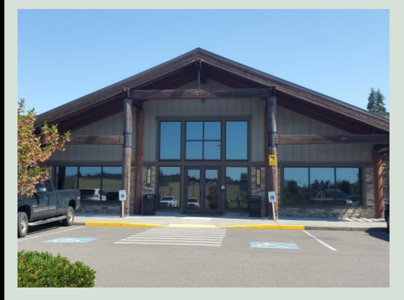
PM Lodge Meeting Have fun with all your Elk friends