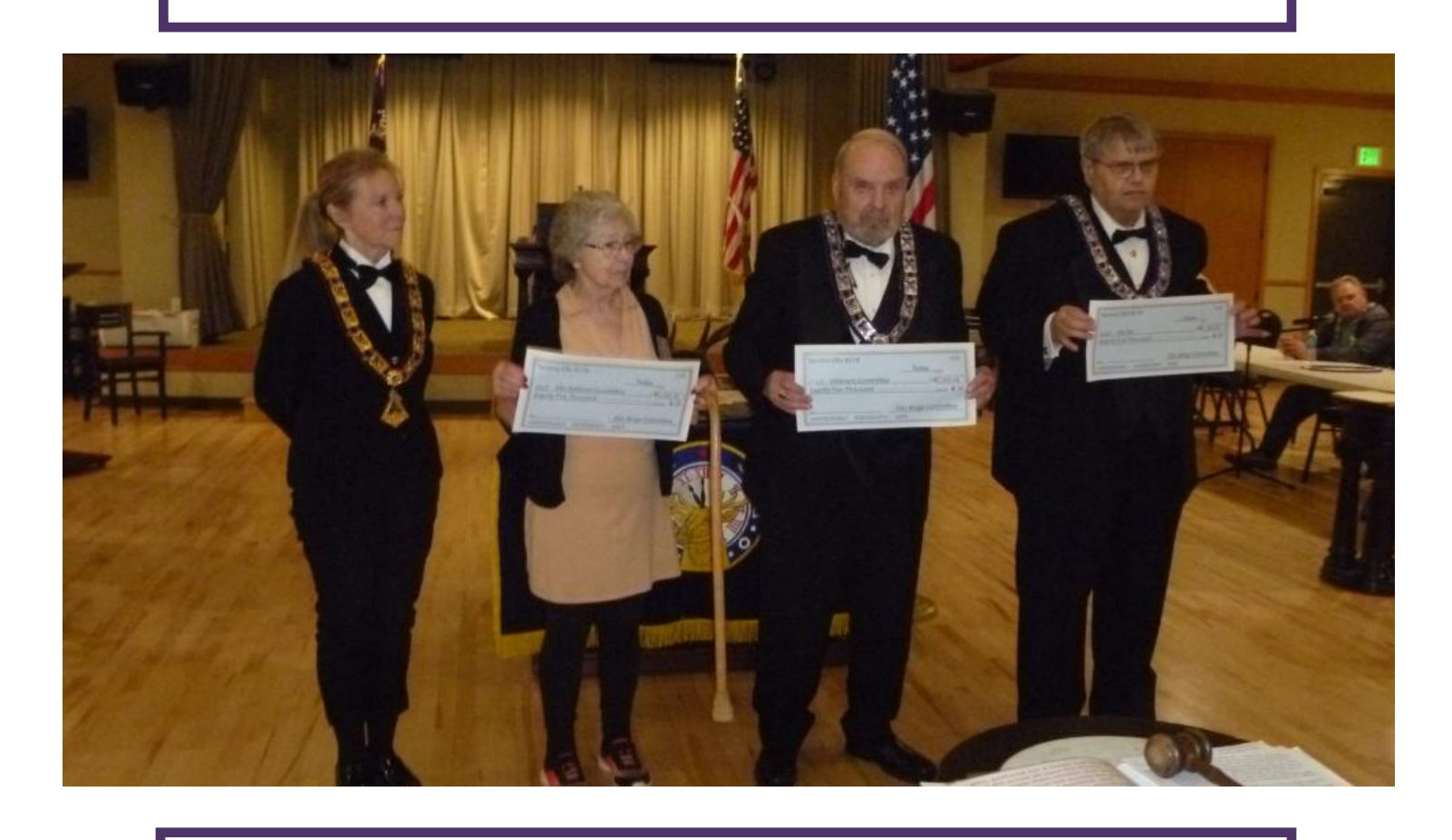
Bingo Supports Lodge Charities