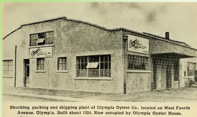
Shucking, packing and shipping plant of Olympia Oyster Co., located on West Fourth Avenue, Olympia. Built about 1924. Now occupied by Olympia Oyster House.

due to financial issues. An auction was held and everything in the restaurant was sold. The building sat vacant until 1996 when a renovated Olympia Oyster House was opened in July by new owners. Another fire in July 2013 caused the restaurant again to be gutted by fire with the walls left standing. This fire was caused by lint buildup in the dryer ducting. (Everyone check your dryer ducting at least once a year.) I remember walking by the burned out remains and feeling sad as I remember eating there as a young child with family. The restaurant rose again from the ashes and reopened a year later.