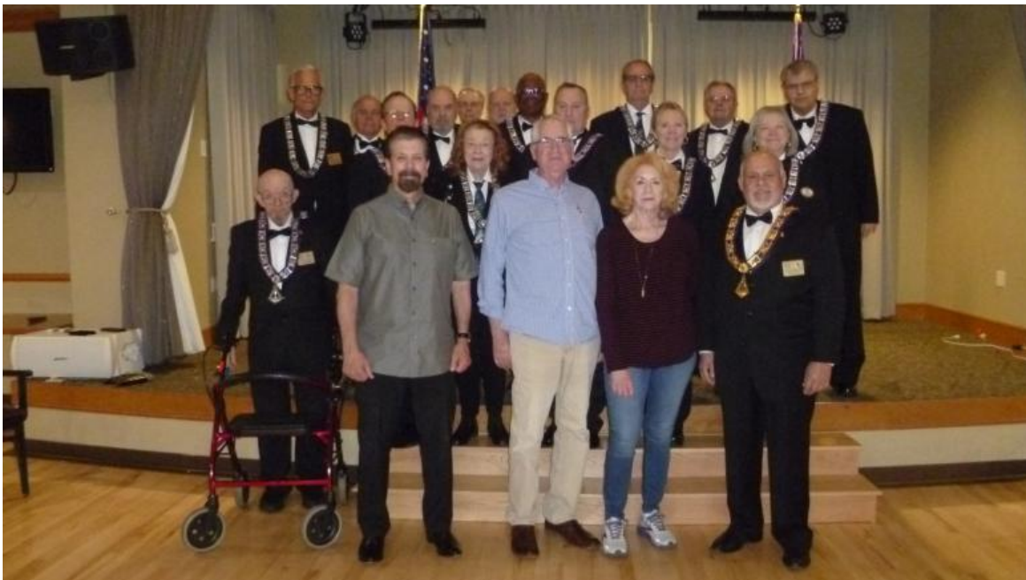
April's Initiation Class