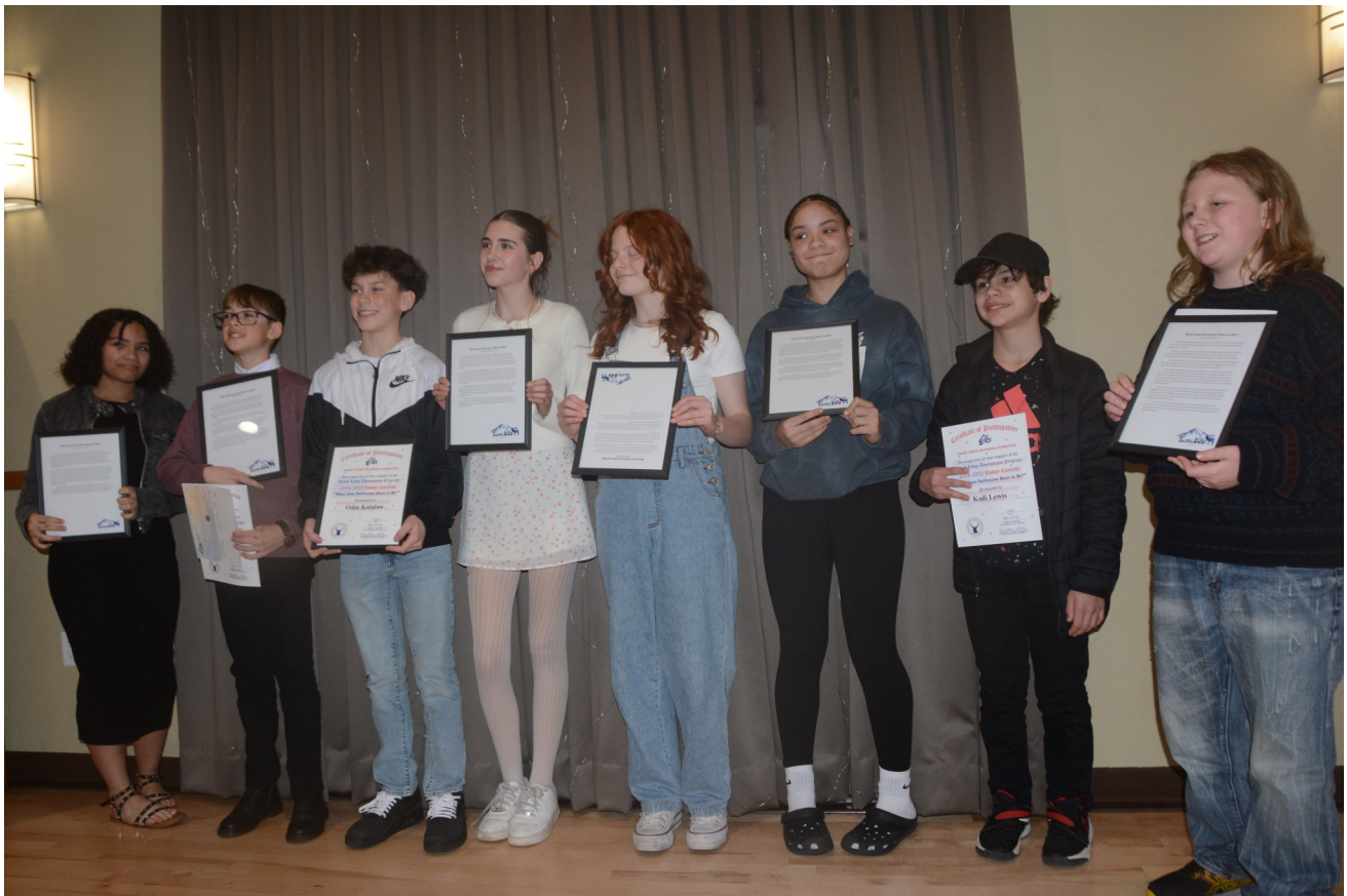
Tacoma Lodge #174