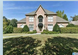
5108 Greystone Way $750,000