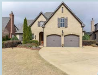
308 Woodward Ct $675,000