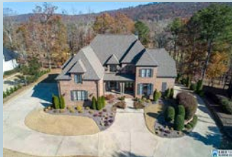
1319 Legacy Dr $899,900