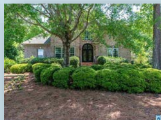
3004 Shandwick Ct $439,000