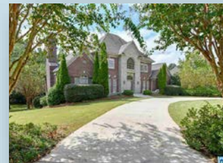
8122 Castlehill Rd $476,000