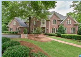
1103 Greymoor Rd $799,000