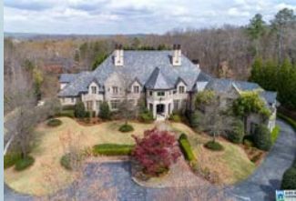
4006 St Charles Dr $4,350,000