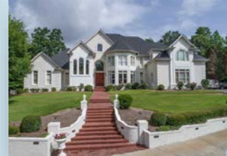
4016 Greystone Dr $1,295,000