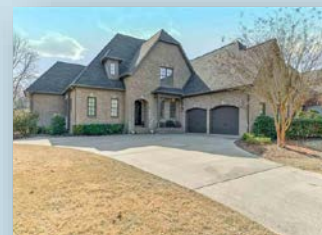
5406 Greystone Way $579,000