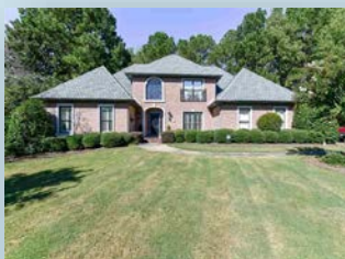
1040 King Stables Cir $497,000