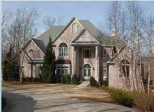
8042 Castlehill Rd $749,900