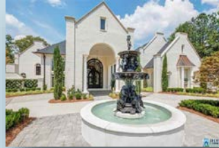
5615 Canongate Ln $2,950,000