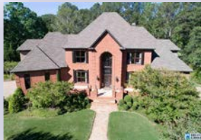
5020 Shandwick Cir $1,250,000