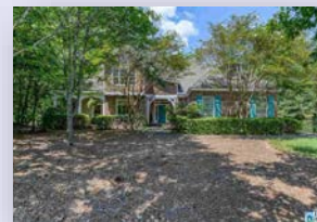
831 Bishops Ct $559,000