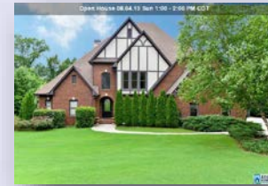
901 Trinity Ct $745,000