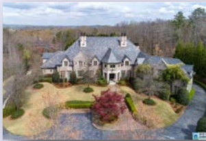
4006 St Charles Dr $4,350,000