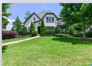
809 Aberlady Pl $650,000