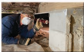
Crawl Space Repairs & Encapsulation