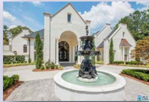
5615 Canongate Ln $2,950,000