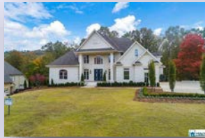
8198 Castlehill Rd $899,900