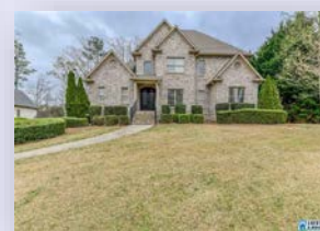
805 Aberlady Pl $645,000