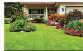
Lawn Care and Maintenance