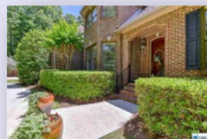
4007 High Court Rd $569,000