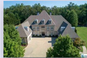
1447 Legacy Dr $1,894,000