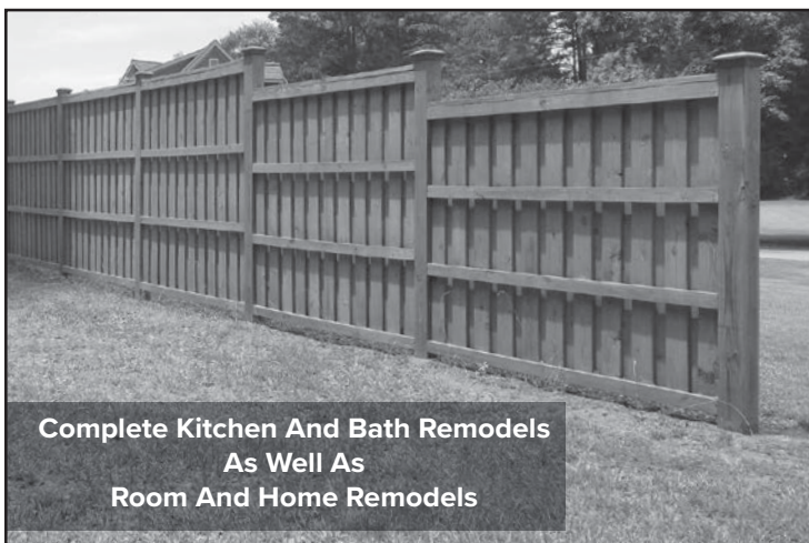
Complete Kitchen And Bath Remodels As Well As Room And Home Remodels