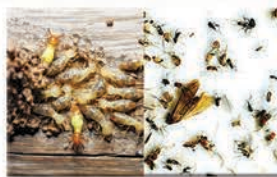
Termite, Pest, Mosquito Control