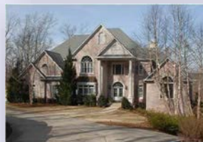
8042 Castlehill Rd $699,900