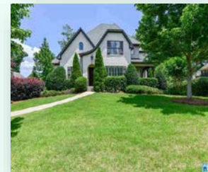
809 Aberlady Pl $639,000