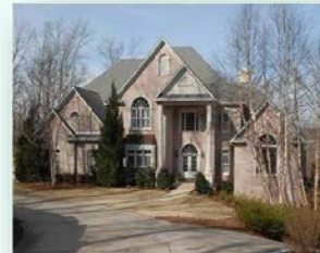
8042 Castlehill Rd $699,900