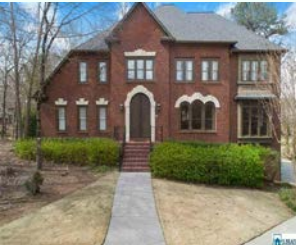
1031 Greymoor Rd $749,000