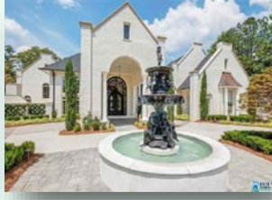
5615 Canongate Ln $2,950,000