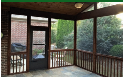
Screened Porches / Slate Tile