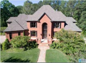
5020 Shandwick Cir $1,250,000