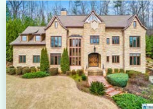
5327 Greystone Way $789,000