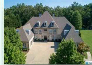
1447 Legacy Dr $1,749,000