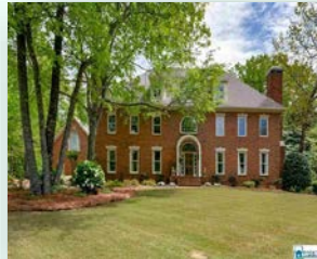
4041 Greystone Dr $715,000