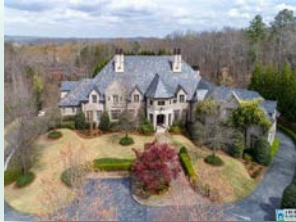
4006 St Charles Dr $4,350,000