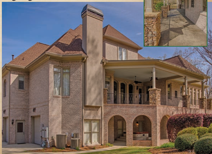
Patio / Porch tops