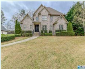
805 Aberlady Pl $645,000