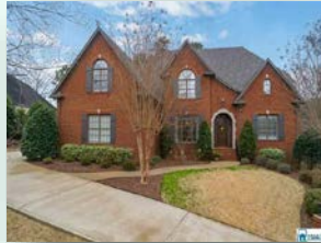
808 Aberlady Pl $799,000