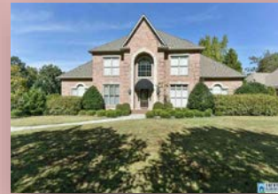
5108 Greystone Way $750,000