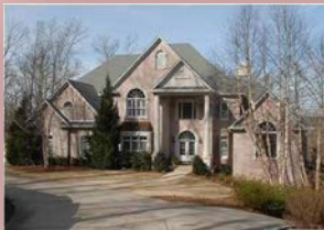
8042 Castlehill Rd $699,900