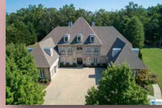
1447 Legacy Dr $1,894,000