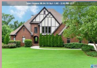
901 Trinity Ct $765,000