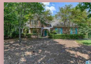
831 Bishops Ct $575,000