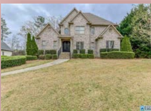
805 Aberlady Place $649, 900