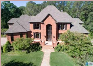
5020 Shandwick Cir $1,250,000