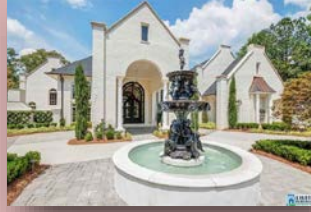
5615 Canongate Ln $2,950,000