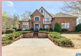
7007 Montrose Rd $689,000