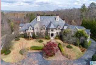
4006 St Charles Dr $4,350,000