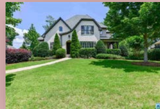
809 Aberlady Pl $650,000