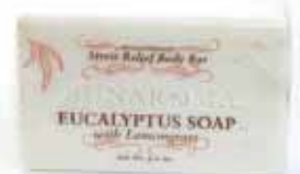
Eucalyptus Soap with Lemongrass 5 oz. M-S418 $5.98