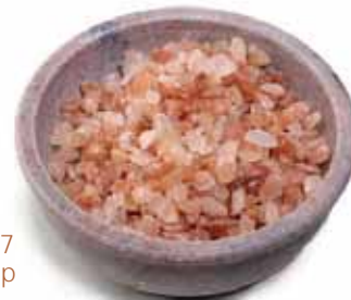
M-P107 close up

One Pound Fine Grain Himalayan Rock Salts M-P133 $13.90