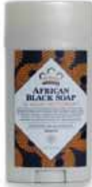
African Black Soap Deodorant M-P359 $19.90