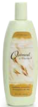
Oatmeal & Vitamin E Lotion 12 fl. oz. M-P331 $7.90