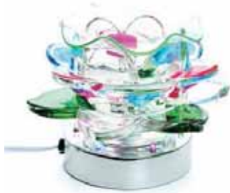
Electric Touch Lamp Oil Burner: Rose 5" tall. O-140 $25.90

Each set comes individually boxed and wrapped. You get it all! Candle and 1/2 oz bottle of oil and oil burner (With this set only)