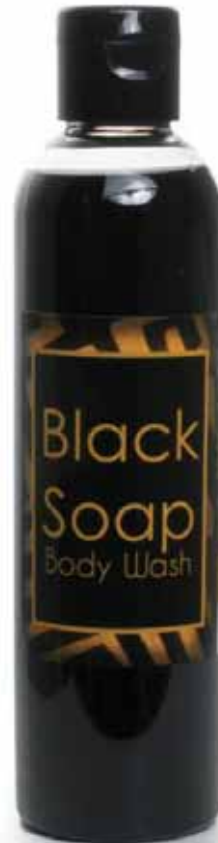
Liquid Black Soap and Body Wash This black soap is enriched with shea butter to heal and soften the skin. 8 oz. Made in the USA. M-S110 $6.98