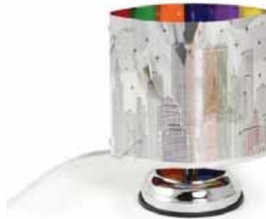
Electric City Lights Oil Burner 8" tall. Made in China. O-172 $35.90 $29.90

Replacement Glass Dish for Oil Burners O-101 $4.00 each