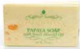
Papaya Soap with Sweet Almond Oil 5 oz. M-S417 $5.98