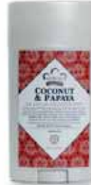
Coconut & Papaya Deodorant M-P360 $19.90