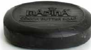
Black Soap with Cocoa Butter and Vitamin E 3.5 oz. M-S201 $3.98