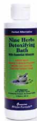
Nine Herbs Detoxifying Bath Formula 8 fl. oz. M-P312 $11.90