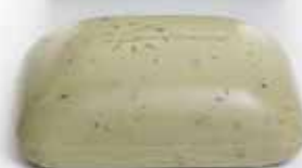
Olive Butter Soap 5½ oz. M-S460 $3.98