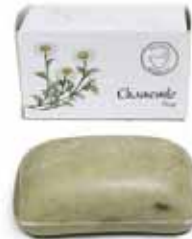
Chamomile Soap 3½ oz. M-S623 $2.98