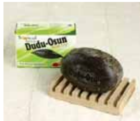
Dudu-Osun Black Soap 5.25 oz. M-S501 $3.98