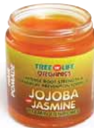
Jojoba Oil & Jasmine M-P245 $7.90