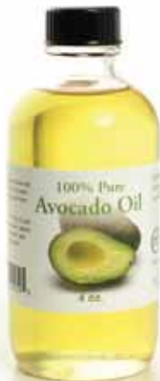
Avocado Oil Avocado Oil is a versatile oil with numerous benefits from culinary to cosmetics. It is a protein-rich moisturizer that is high in Vitamins A, D, and E, plus potassium and other minerals. 4 oz. M-P259 $5.90