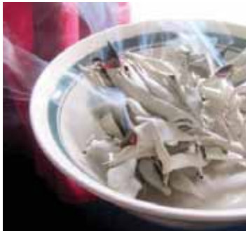
White Ceremonial Sage Use fragrant sage leaves to purify the air in your home, ward off illness, headaches, fever and toxins. 4 oz. Bag M-P146 $19.90