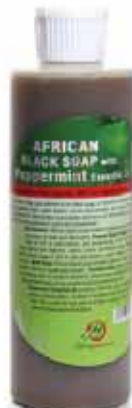
Peppermint Liquid Soap 8 oz. M-S107 $7.58