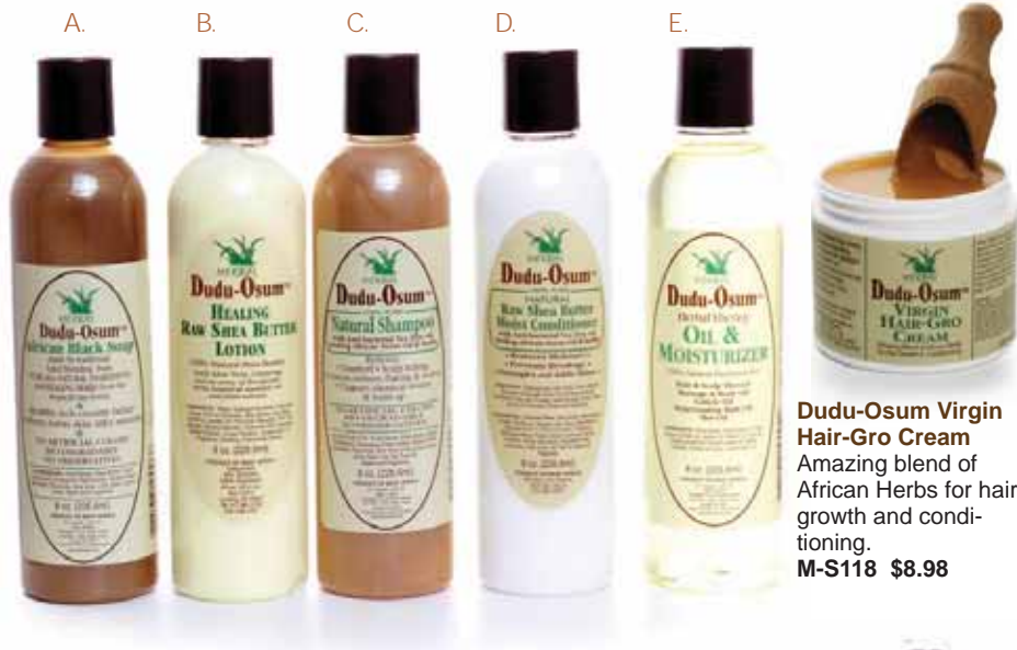
Duda-Osum Virgin Hair-Gro Cream Amazing blend of African Herbs for hair growth and conditioning. M-S118 $8.98

Get them all! Save $5.00 Duda-Osum Herbal Bath-Body-Hair Kit Comes with natural shampoo, raw shea butter lotion, African black soap, conditioner, and oil & moisturizer. M-P198 $39.90