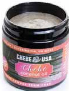
Chebe Coconut Oil 4 oz. M-P415 $19.90