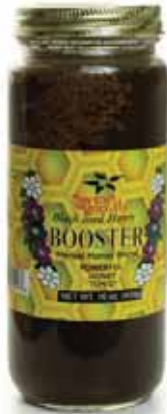
Black Seed Honey Booster Made from a powerful blend of manuka honey, royal jelly, black seed oil, and other all-natural herbs. 16 oz. M-550 $27.90