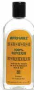
Africa's Instant Fix 8.5 oz. Made in the US. Kosher 100% Glycerin M-411 $9.90