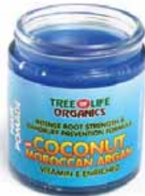
Coconut & Moroccan Argan M-P243 $7.90