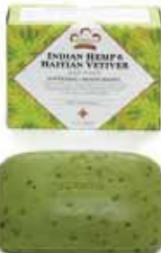
Indian Hemp & Haitian Vetiver Soap 5 oz. M-S313 $5.98