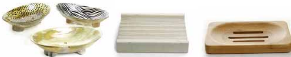
African Bone Soap Tray: Assorted Designs M-408 $9.90 each