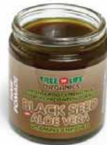
Black Seed & Aloe Vera M-P241 $7.90