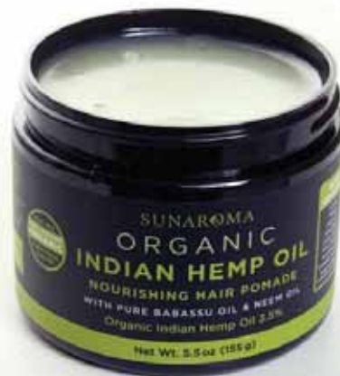
Organic Indian Hemp Hair Pomade - 5.5 oz Repair and Grow Dry, Broken, Frizzy Hair. M-P395 $11.90