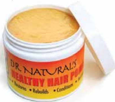
Healthy Hair Pomade Made with natural herbs, oils, and vitamins that nourish your hair to a healthy and natural shine. Enriched with coconut oil and shea oil. 3.5 oz. M-P148 $9.90