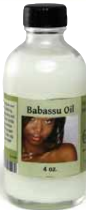
Babassu Oil Helps with problems caused by eczema, makes hair and skin shiny, and soothing irritated and sensitive skin. 4 oz. M-P299 $9.90 16 oz. M-P299LB $27.90