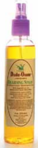
Duda-Osum Anti-Itching Braiding Spray No build up residue. Braided styles last longer. Conditions, moisturizes, eliminates itchy dry scalp, reduces breakage, and provides healthy sheen. Made in Nigeria M-S120 $8.98