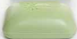
Aloe Butter Soap 5½ oz. M-S459 $3.98