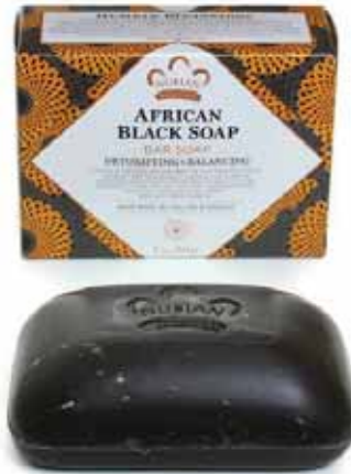
Black Soap with Shea Butter One of our best-selling soaps, this black soap with oats and shea butter works to purify, exfoliate, and moisturize your skin. 5 oz. M-S301 $5.98