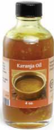
Karanja Oil Can be used to treat eczema, psoriasis, skin ulcers, dandruff, or to promote wound healing. 4 oz. M-P217 $11.90