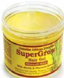
SuperGrow Hair Gel: Regular Hold 4 oz. M-P356 $11.90