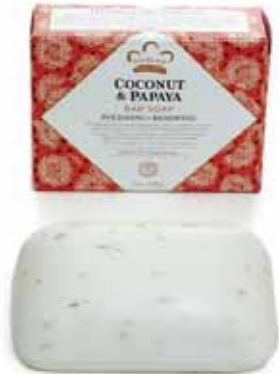
Coconut and Papaya Soap Nourish your skin with this vitamin and mineral enriched soap. 5 oz. M-S310 $5.98