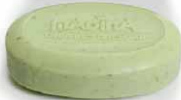
Shea Butter and Aloe Vera Soap The clean of African black soap meets the rich moisture of shea butter and the healing power of aloe vera. 3.5 oz. M-S202 $3.98