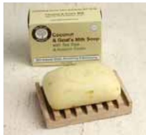
Virgin Coconut & Goats Milk Soap 5 oz. M-S354 $3.98