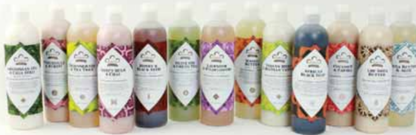
Set of 13 Lotions Each bottle is 13 oz. Only $16.76 each (in set of 13) M-139 $217.90