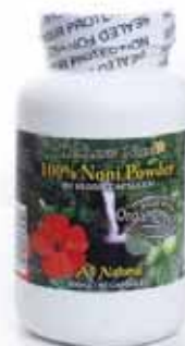
100% Noni Capsules Cleanses the body of harmful bacteria and increases cell function. 50 capsules. 517 mg. M-559 $27.90