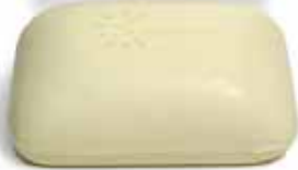
Argan Oil & Shea Butter Soap 5 oz. M-S462 $3.98