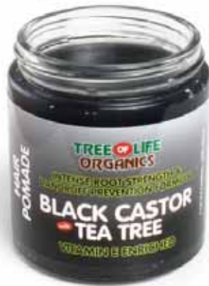
Black Castor & Tea Tree M-P242 $7.90