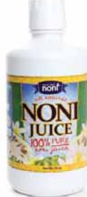
Find All-Over Healing with 100% Pure Noni Grown in the lush, tropical jungles of Hawaii, Noni juice has been used for centuries for its far-reaching health benefits. 16 oz. M-541 $35.90 32 oz. M-542 $47.90