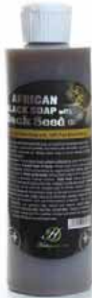
Black Seed Oil Liquid Black Soap 8 oz. M-S109 $7.58