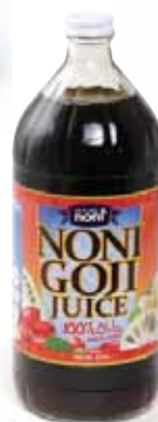
100% Noni Goji Juice Get all the benefits of noni juice with the added nutrients of Goji berries. 32 oz. M-544 $47.90