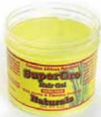
SuperGrow Hair Gel: Extra Hold 4 oz. M-P309 $11.90