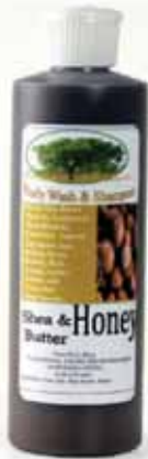
African Dudu-Shea Honey Soap 8 oz. Made in Niger. M-S114 $7.90