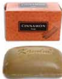
Cinnamon Soap 3½ oz. M-S624 $2.98