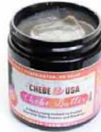
Chebe Butter 4 oz. M-P414 $29.90