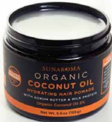
Organic Coconut Oil Hair Pomade - 5.5 oz Restore and Protect Dry, Damaged Hair.... Naturally! M-P394 $11.90