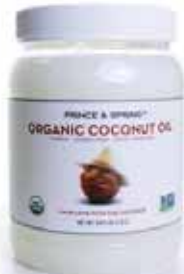
Organic Extra Virgin Coconut Oil 54 oz. M-224 $59.90