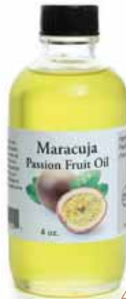
Maracuja Passion Flower Oil Passion Flower oil gently soothes and calms stressed skin and is high in healing essential fatty acids. 1 oz. M-P114 $11.90 4 oz. M-P115 $33.90