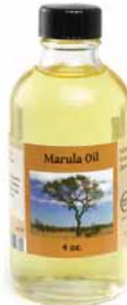
Marula Oil Marula oil is extracted from the kernels (nuts) of the Marula tree (Sclerocarya birrea). Made in South Africa. 4 oz. M-P187 $49.90 $35.90