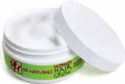
Ultimate Hair Grow This shea butter enriched treatment strengthens roots, promotes hair growth, conditions and restores. Enriched with avocado oil. 4 oz. M-P122 $7.90