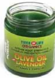
Olive Oil & Lavender M-P246 $7.90