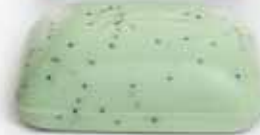
Avocado & Poppy Seed Soap 5½ oz. M-S458 $3.98