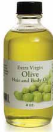
Olive Hair & Body Oil Nourish and soften your skin and hair with this 100% virgin olive oil hair and body conditioner. 4 oz. M-P350 $4.98