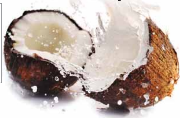
100% Organic Virgin Coconut Oil 4 oz. jar. M-220 $15.90 1 lb. (16 oz.) M-221 $39.90