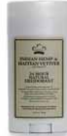
Indian Hemp & Haitian Vetiver Deodorant M-P361 $19.90