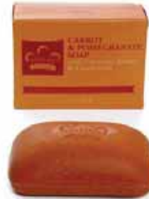
Carrot and Pomegranate 5 oz. M-S312 $5.98