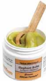
Elephant Balm Analgesic Ointment 2 oz. H-036 $11.90