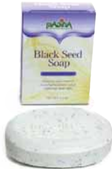
Black Seed Soap This new soap blends the anti-aging properties of black seed with the healing properties of shea butter and jojoba oil. 3.5 oz. M-S213 $3.98