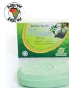
Neem & Black Seed Herbal Soap M-S546 $4.58