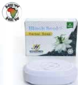
Black Seed Herbal Soap M-S544 $4.58