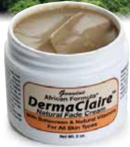
DermaClaire Natural Fade Cream - 2 oz. M-P358 $17.90