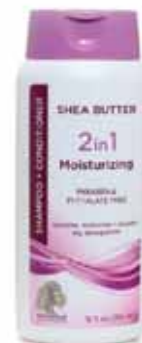
African Shea Butter Shampoo/Conditioner Gently cleans without stripping and can be used everyday. M-P233 $7.90