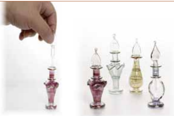
Egyptian Glass Perfume Bottles 4"-5" tall. Made in Egypt. O-120 $5.90 each

Set of Ten Tea Light Candles for Burners O-100 $2.98