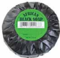
Pure African Black Soap 2.8 oz. M-S221 $3.58