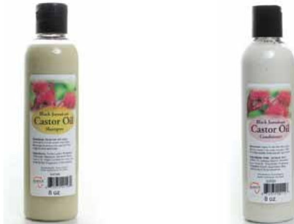
Black Jamaican Castor Oil Shampoo M-P349 $7.90