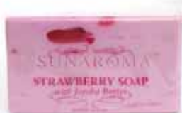
Strawberry Soap with Jojoba Butter 5 oz. M-S416 $5.98