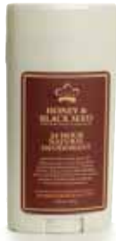
Honey & Black Seed Natural Deodorant M-P136 $19.90