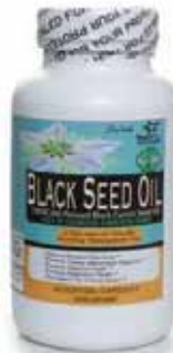
Pure Black Seed Capsules Many antioxidant properties, which help keep your skin youthful and clear. 90 capsules. M-558 $27.90