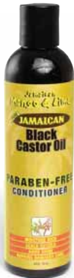
Jamaican Black Castor Conditioner Nourishes and revitalizes hair while stopping breakage. 8 oz. M-P302 $15.90