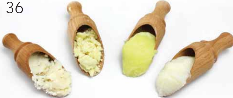
Wrinkle Reducing Mango Butter