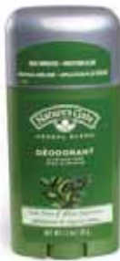
Herbal Tea Tree Deodorant Made in U.S.A. M-P255 $15.90