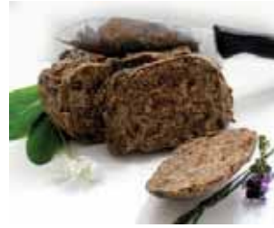
Hand-Crafted Natural Black Soap M-S520 Price based on size