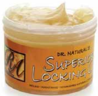
Superior Locking Gel For centuries, the Maasai have used natural ingredients to lock their hair. Use these same natural ingredients to maintain your locks naturally. 8 oz. M-P147 $9.90