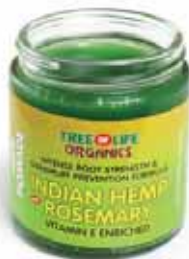
Indian Hemp & Rosemary M-P244 $7.90