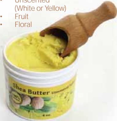
Shea Butter 4 oz. Jar M-182 $7.90 $5.90 each