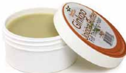
Ginkgo Jojoba Butter For Thinning Hair Increases hair growth, softens hair, while reducing itchiness and irritation. 4 oz. M-P130 $23.90