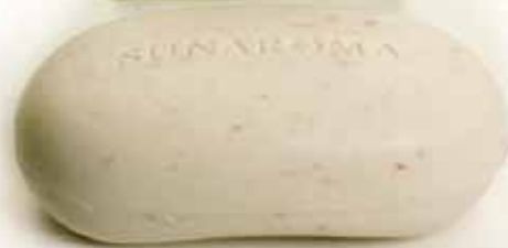
Oatmeal and Vitamin E Moisturizes your skin with natural anti-aging properties. 4.25 oz. M-S414 $3.98