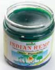
Indian Hemp Hair Pomade M-P180 $7.90