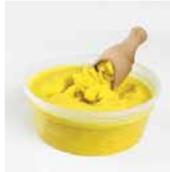
Pure African Shea Butter Yellow or white. 7 oz. M-185 $9.99 $7.90