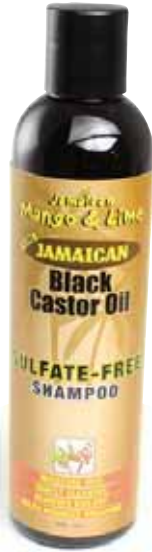
Black Castor Oil Shampoo Naturally healing shampoo. 8 oz. M-P298 $15.90