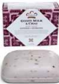
Goats Milk and Chai Soap 5 oz. M-S311 $5.98