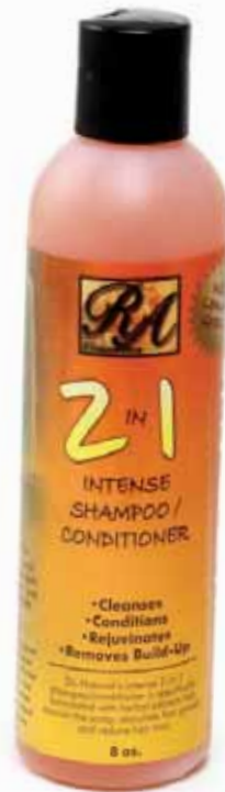
Shampoo & Conditioner in One! This natural shampoo and conditioner is enhanced with coconut oil, avocado oil and aloe to nourish the scalp, stimulate hair growth, and reduce hair loss. 8 oz. M-P121 $7.90