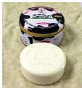
Milk Whitening Soap Naturally whitens and lightens with milk proteins. 3½ oz. M-S220 $5.98