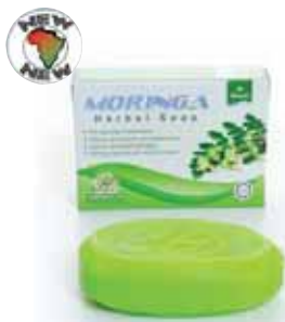
Moringa Herbal Soap M-S545 $4.58