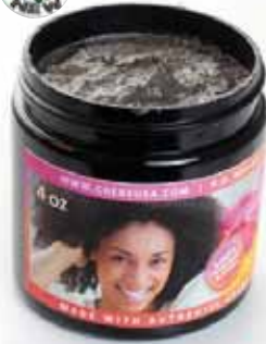
Chebe Paste 4 oz. M-P411 $23.90