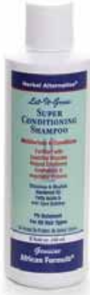
Let-It-Grow Super Conditioning Shampoo 8 oz. M-P308 $11.90