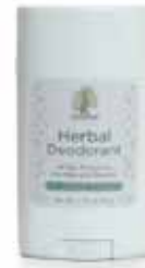
Herbal Deodorant 1.75 oz M-P165 $7.90 each