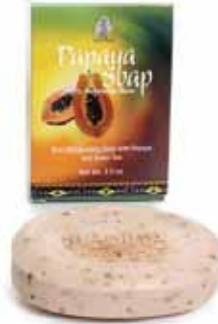
Papaya Soap Exfoliates, purifies, and softens skin with papaya and shea butter. 3.5 oz. M-S215 $3.98