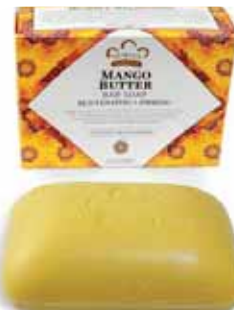
Mango Butter Soap This mango butter soap smells so good you'll want to eat it! 5 oz. M-S303 $5.98