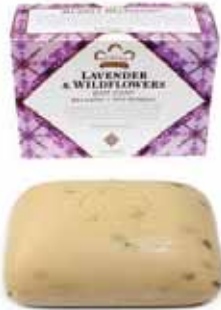
Shea Butter Soap with Lavender and Wildflowers Revel in the delicate scent, while giving your skin moisture and nutrition. 5 oz. M-S302 $5.98