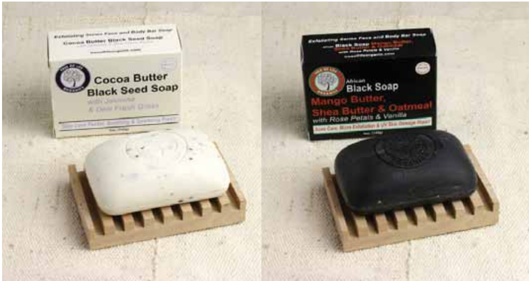
Cocoa Butter & Black Seed Soap 5 oz. M-S353 $3.98