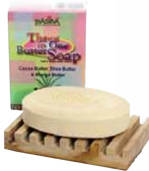
Three in One Body Butter Soap Made with shea, mango, and cocoa butter. 3.5 oz. M-S206 $3.98