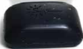
Shea Butter Black Soap 5 oz. M-S463 $3.98