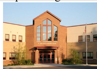
St. Bede School Faith Formation Center 36399 N. Wilson Rd, Ingleside, IL