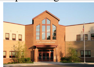
St. Bede School Faith Formation Center 36399 N. Wilson Rd, Ingleside, IL