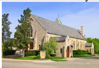
St. Peter Church 557 Lake Street Antioch, IL 60002