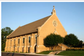
St. Bede Church 36455 N. Wilson Road Ingleside, IL 60041