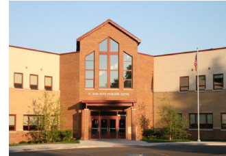
St. Bede School Faith Formation Center 36399 N. Wilson Rd, Ingleside, IL