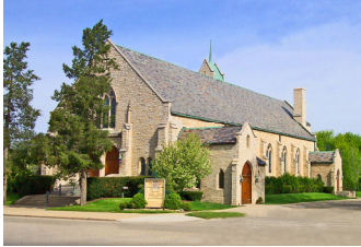
St. Peter Church 557 Lake Street Antioch, IL 60002