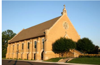
St. Bede Church 36455 N. Wilson Road Ingleside, IL 60041