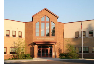
St. Bede School Faith Formation Center 36399 N. Wilson Rd, Ingleside, IL