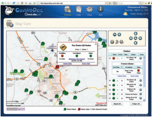
OmniSite's GuardDog web interface provides simple web navigation for monitoring pump stations.

The Crystal Ball includes OmniSite's "plug and play" GuardDog software, which eliminates the need for custom programming.