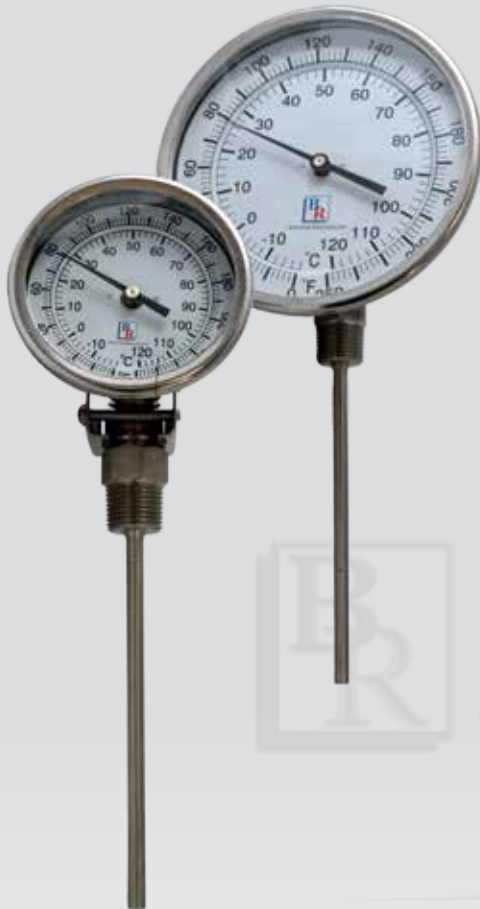
Model BR3A and BR5A Bi-Metal Thermometer Adjustable Angle Type