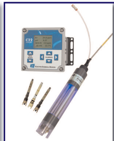
HYDRA® NH 4 -N