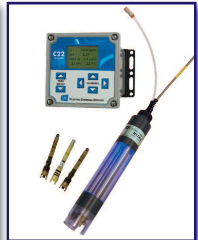
HYDRA ® NO 3 -N