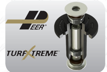
PEER® Spindles – Maintenance free with Contamination Exclusion Technology