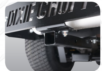
Hitch Receiver – Class 1 hitch for easier mounting of accessories