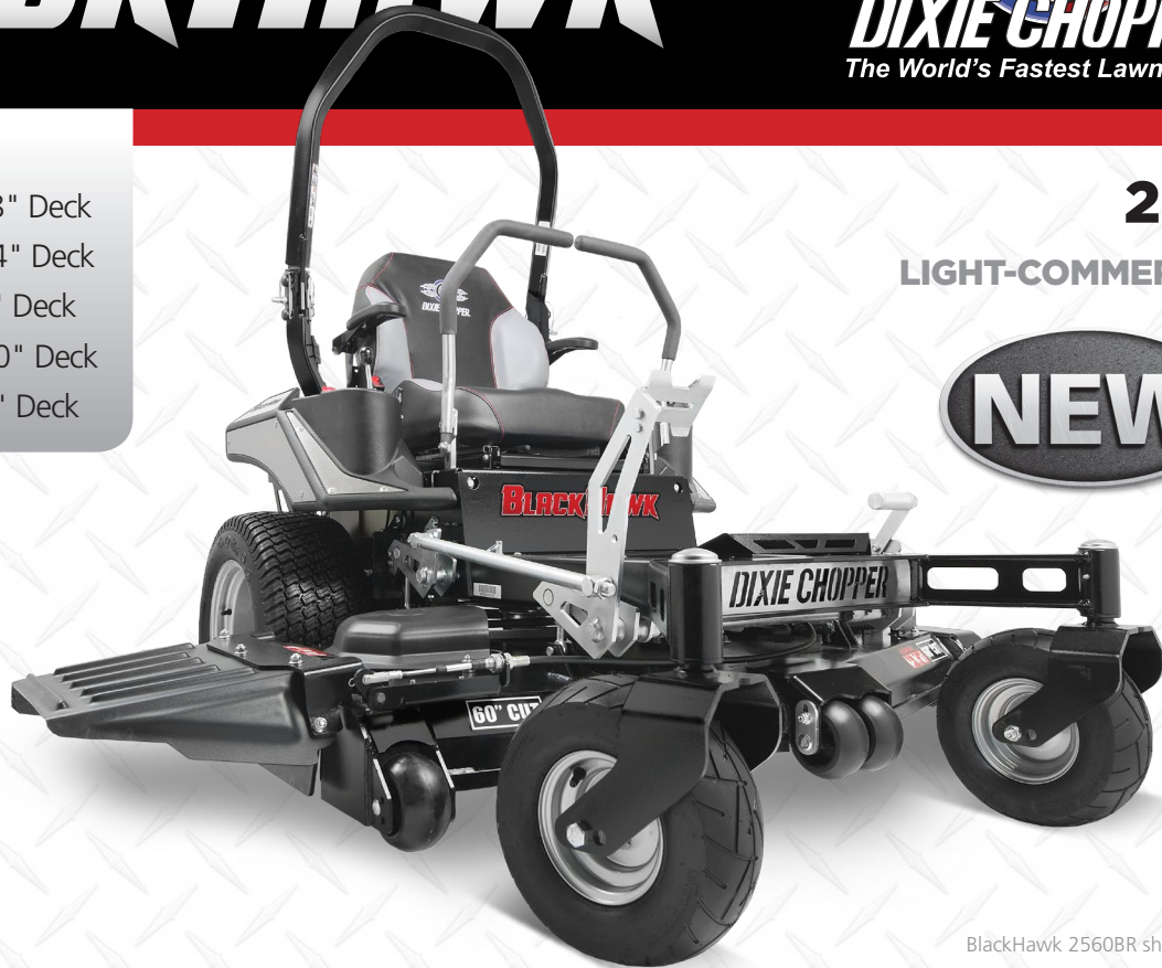
BlackHawk 2560BR shown*