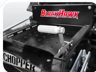
OCDC – Foot-operated to keep your hands on the steering levers