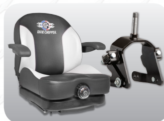
Total Comfort – Suspension seat and Springer Forks for highest quality ride.