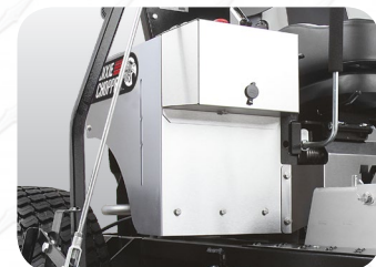
Two 6 Gallon Fuel Tanks – More fuel capacity eliminates frequent fill-ups.