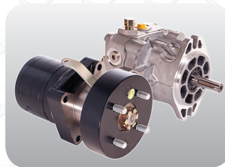
Pumps & Wheel Motors – Stronger transmissions for extended system life.