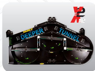
X2 "Wind Tunnel" Deck – Increases airflow and reduces build-up inside deck.