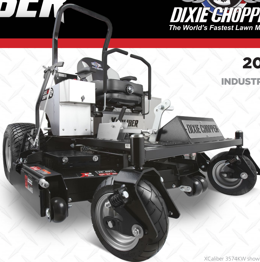
XCaliber 3574KW shown*