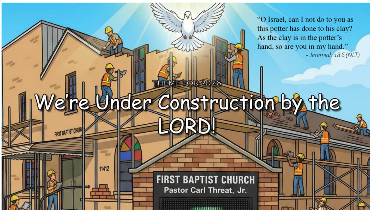
2026 Theme Banner