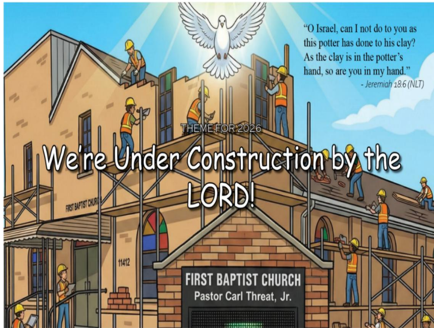
2026 Theme Banner