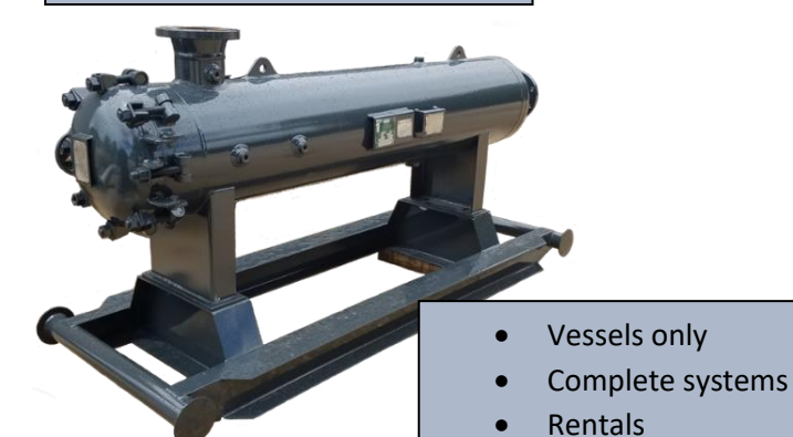
Also Available: Bag Filters, Sock Filters, Tube Filters and others