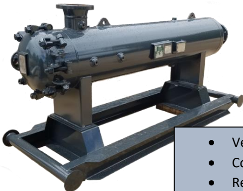
Filter & Coalescer Vessels

Also Available: Bag Filters, Sock Filters, Tube Filters and others