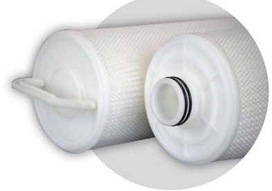
6.25" Filter High Flow Elements