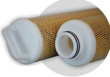
4.25" Filter Elements