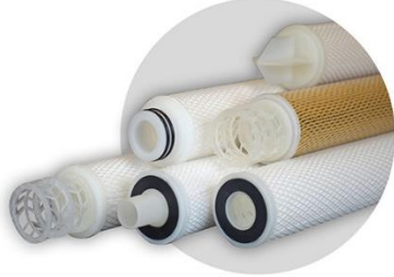
Common 2.5" Filter Elements