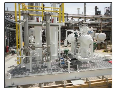
Solvent Recovery Systems