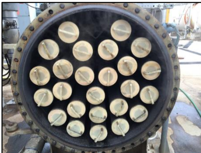
Gas and Liquid Filters

Nexo Solutions can supply complete turn-key systems for contaminant removal.