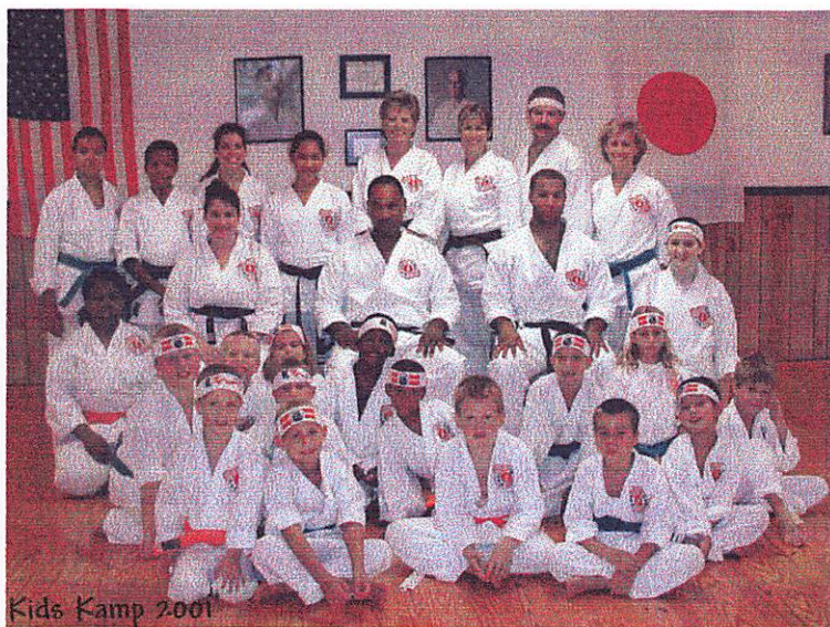
Kids Kamp 2001