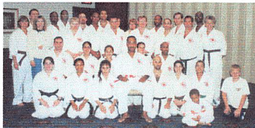
Yoseikan II in attendance.