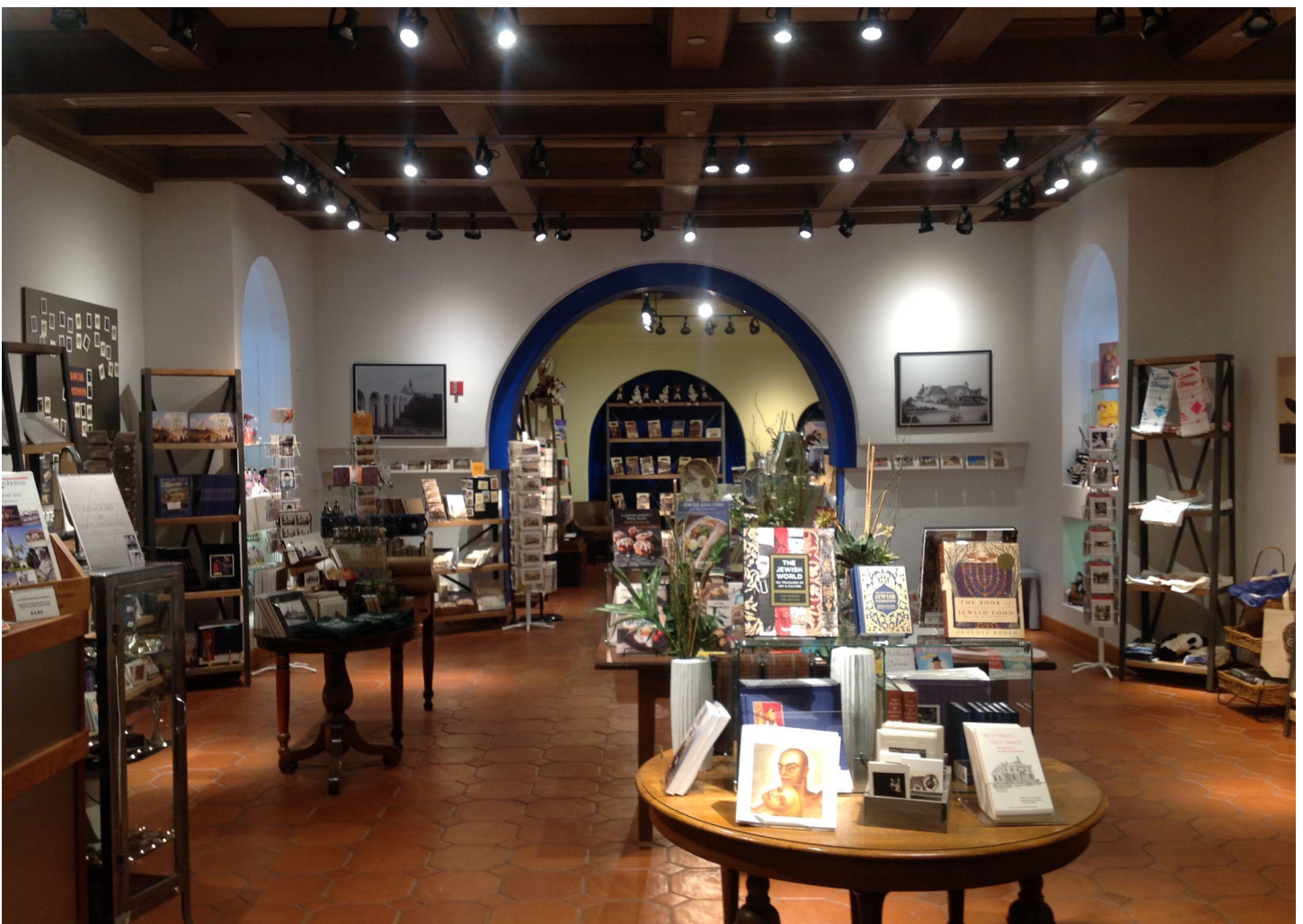
You can visit the gift shop before you leave, if you would like to.