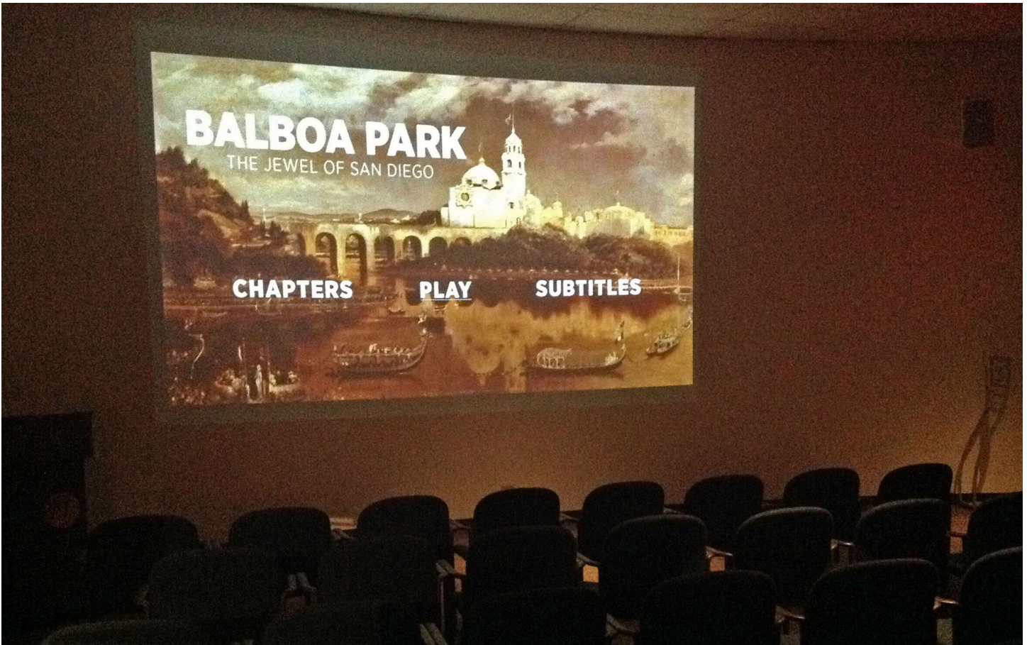
If there are a lot of people visiting the museum, it could get noisy. The Thornton Theater is a good place to take a break if you need a quiet space—you can sit in the theater between screenings.