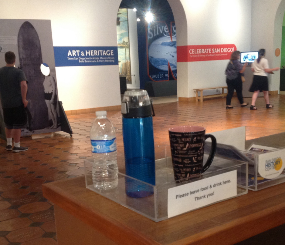
Food and drinks are not allowed in the museum. If you brought food or a drink, you can leave it in the box behind the admissions desk and pick it up when you leave.