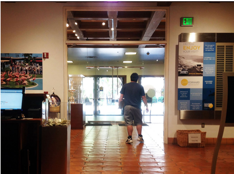
When you are ready to leave, find your group. The exit is the same big glass doors that you entered through.