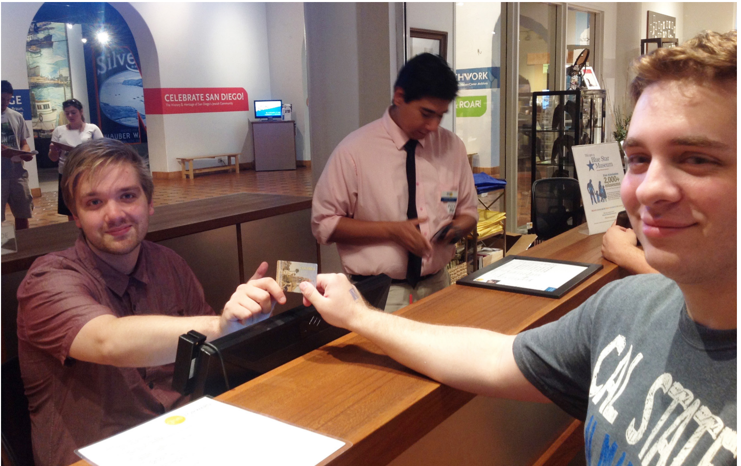
If you have a Balboa Park Explorer Pass, staff will scan it for you.