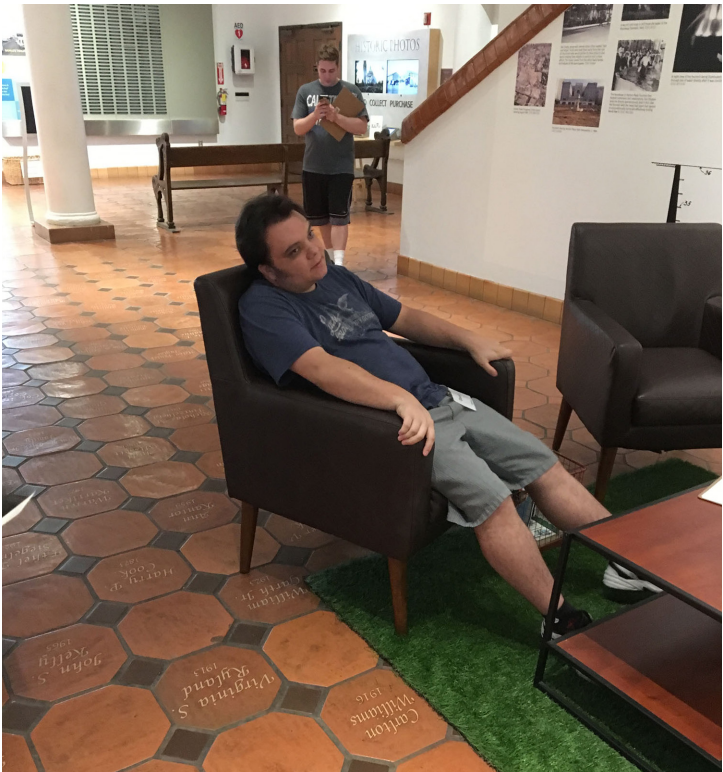
There are chairs in the main lobby where you can rest.