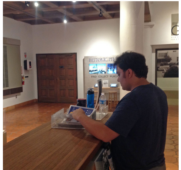
Don't forget to return your map to the admissions desk and pick up any food or drink that you left.