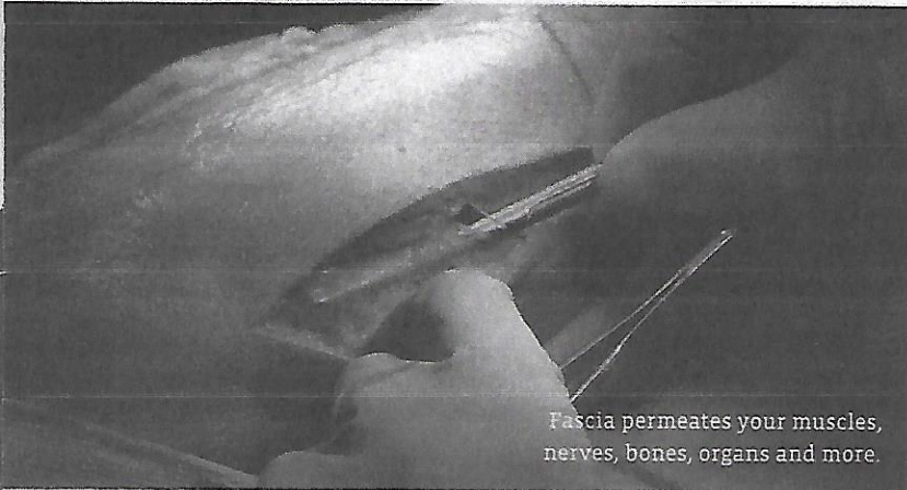
Fascia permeates your muscles, nerves, bones, organs and more.

Grab hold of the collar of your shirt and give it a little tug. Your whole shirt responds, right? Your collar pulls into the back of your neck. The tail of your shirt inches up the small of your back. Your sleeves move up your forearms. Then it falls back into place. That's a bit like fascia. It fits like a giant, body-hugging T-shirt over your whole body, from the top of your head to the tips of your toes and crisscrossing back and forth and through and back again. You can't move just one piece of it, and you can't make a move without bringing it along.