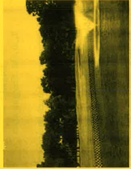
Pecan Valley River Course

A driving range is located across the river approximately 200 yards from the Club House. It has several target greens and a practice sand trap.