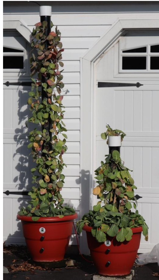
Figure 7 - Plants on the right are grown using Mycorrhizal inoculants

While bigger plants are normally better, most hemp growers desire seed production. Growth does not necessarily mean more seeds.