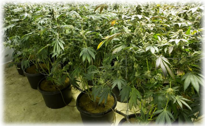
Figure 4 - Drip irrigation

Drip irrigation has been used for thousands of years. It saves water and nutrients by allowing water to drip slowly to the roots of plants, either from above the soil surface or buried below the surface. However, what once was considered a "God sent" is now a risk. It is not a risk because it saves water and time; its a risk because our needs have changed. Drip irrigation is not designed to provide water throughout the plant's life cycle. It does not take into consideration the plant's nutritional needs throughout its growth phases. Drip irrigation is a low-cost effective solution for small irrigation projects but when you are trying to grow plants or provide food, textiles, and medicine for millions of people the concept is impracticable. Germinating seeds and transporting them to seed trays only to place them in 6-inch containers is costly. When they have outgrown their space they need to be transported to large vessels. Nobody doubts that this process is impracticable.