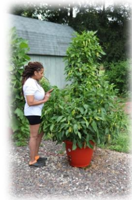
Figure 1 - 1,000 Banana peppers