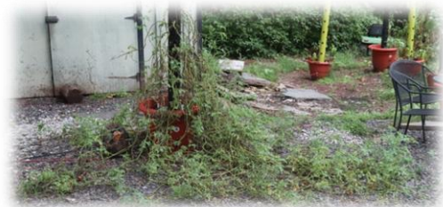
Figure 6 Tomato plants growing for nine months

innoculate groups and categories of plants to control diseases and pest. You don't have to worry about carrying over chemicals into other growing communities.