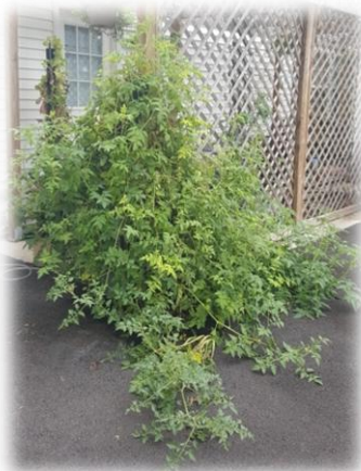
Figure 5 - 1,000 Cherry tomatoes, 16 ft wide

Most growers rely on rain or irrigation systems to water their plants. Plants that experience prolong drought become stressed and lose their vitality. Some plants find it hard if not impossible to bounce back and restore new growth in areas that have collapsed due to lack of care. If the soil gets excessively dry, water will pass through it. It is like drinking a cup of water with a hole in it. It is easy to assume that the water applied to the planter is taken up by the plant. Water absorption into the plant's root system takes time. Torpedopot™ aids in the photosynthesis and respiration process.