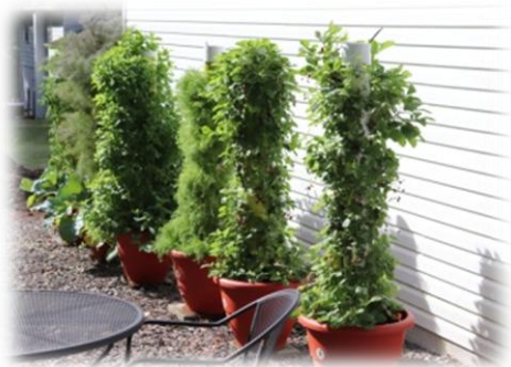
Figure 2 - Thousands of herbs