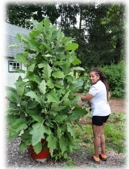
Figure 3 - 52 Eggplants