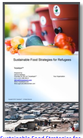
Sustainable Food Strategies for