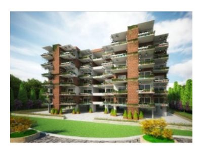
Torpedopot Central Watering System (CWS-01)