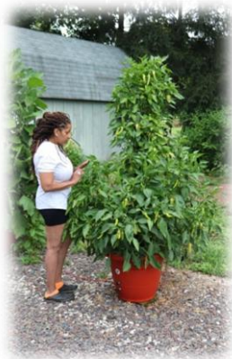
1,000 Banana peppers