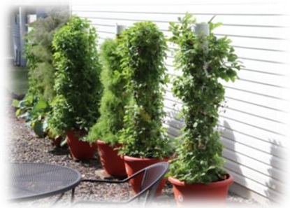
Thousands of herbs