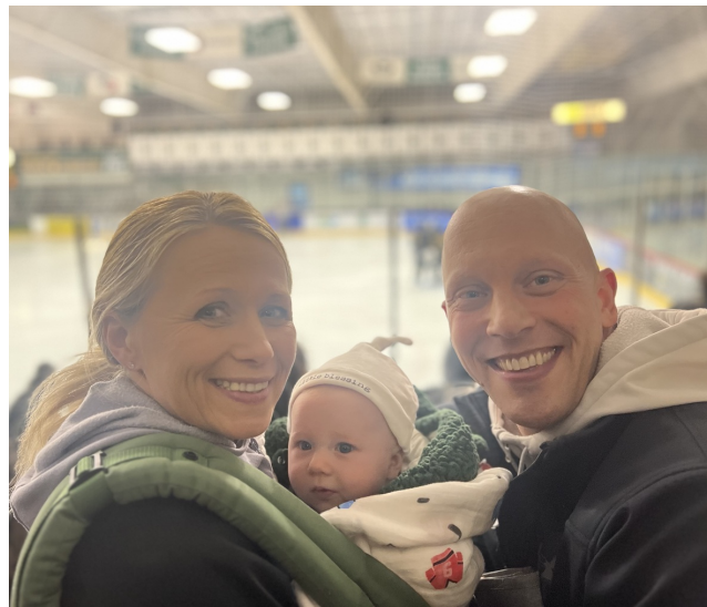
NCAA first round St Olaf vs St Norberts