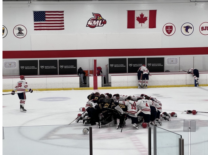
St Mary's praying with St Olaf.

as a whole, that God is using a bunch of tough rugged hockey players to pause, pray and honor him. As I learned recently about the book of Proverbs, as one pastor put it, "Proverbs means pro verb, in other words - put it into action! These players are doing just that.