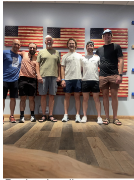
Patriots Landing (Supporting our Vets) - 3 minutes from The Ark Encounter