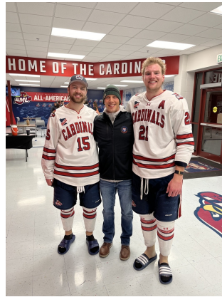
St Mary's Twin brother's after their last game in college