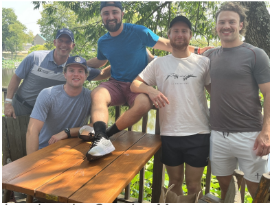
Lunch at the Creation Museum