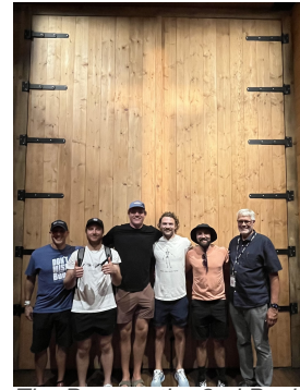
The Door on the 2nd Deck of the Ark - Have you entered through the Door??