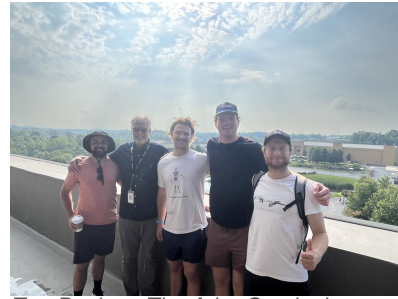
Top Deck on The Ark - Overlook

THANK YOU FOR SENDING US TO THE ARK ENCOUNTER/CREATION MUSEUM! THIS WAS THE 2nd ANNUAL I SOUGHT, I FOUND INSPIRED EVIDENCE TOUR.