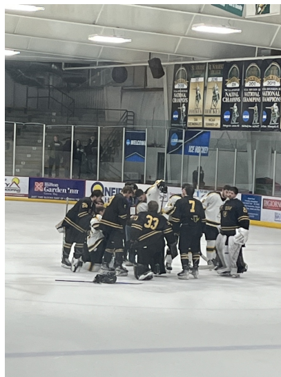
St Olaf & St Norberts finishing giving thanks to Jesus! Win or Lose - honoring Christ!