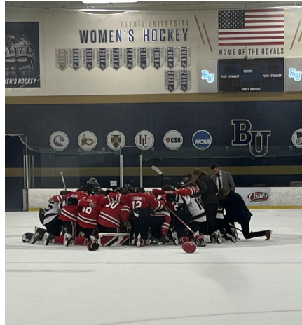
Bethel praying with St Mary's.

Gustavus started praying on their own to start the season!