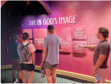
Fearfully & Wonderfully Made Exhibit @ Creation Museum