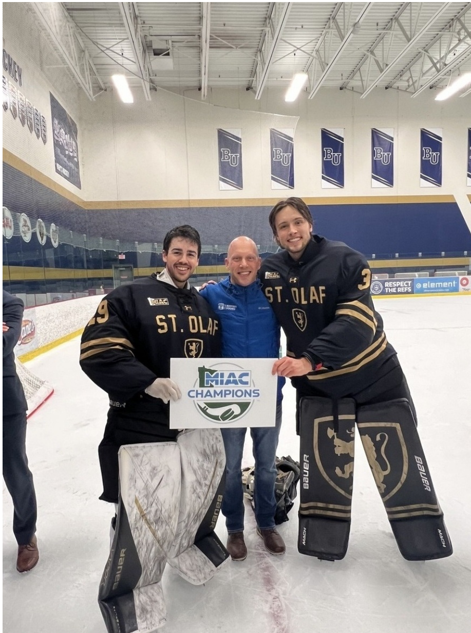
ST OLAF WINS MIAC PLAYOFF CHAMPIONSHIP - 2 OUT OF LAST 3 YEARS!