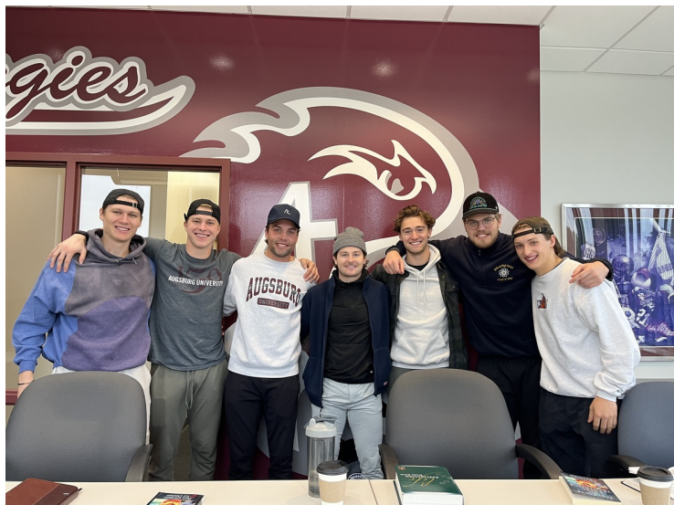
Two men gave their lives to Christ at Augsburg this past fall!