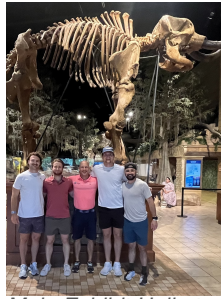
Main Exhibit Hall at Creation Museum