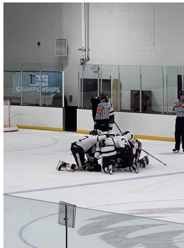
Augsburg started praying after games this year too!