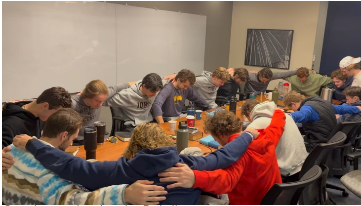
Saturday morning chapel at Bethel!