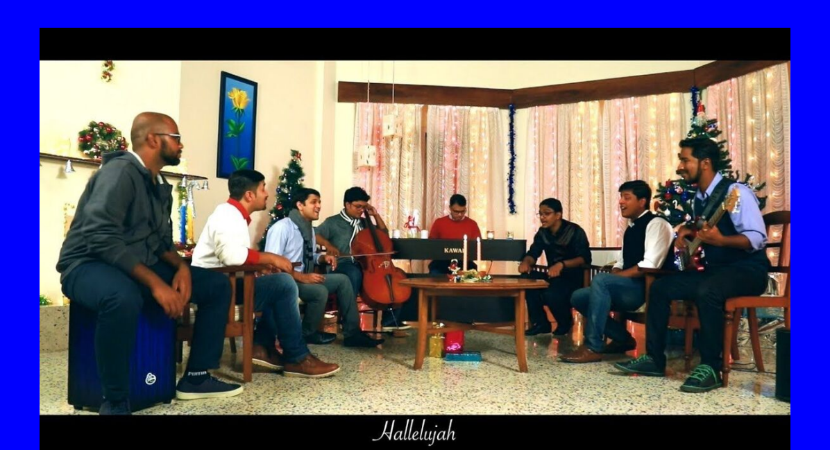
COME BE BORN AGAIN - LIVING STONES QUARTET