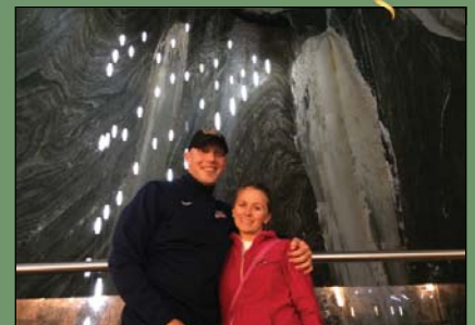
Turda Salt Mine in Romania