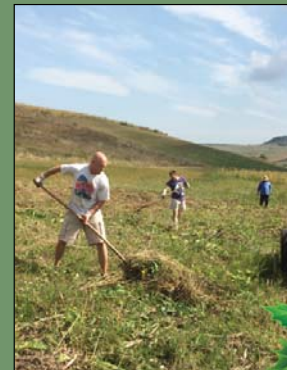
Learning how to potato farm Romanian style.

also a caricatured view of even the best known ones. Every religion at its core is exclusive." I gave a little background to who Ravi is, that he was born and raised a Hindu and came to a saving knowledge of Jesus Christ at age 17. He is a full time apologist traveling the world and an incredibly intelligent source of biblical truth which translates well into the college level academic world; and a trusted resource.