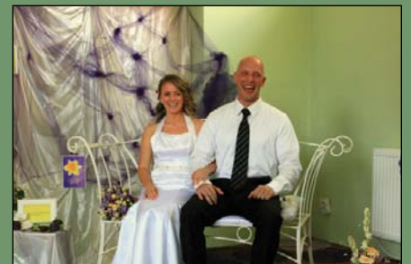
Pre-wedding Ceremony A Joy-filled day!