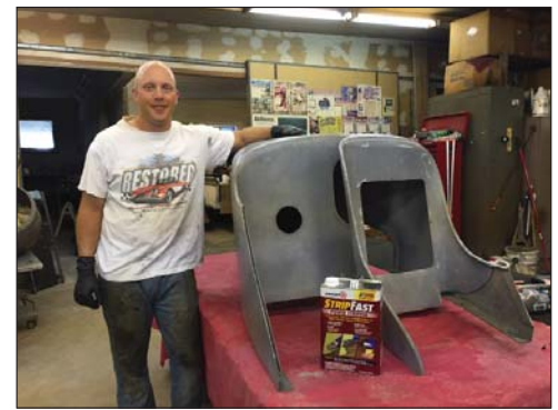
1935 Indianapolis 500 Racecar