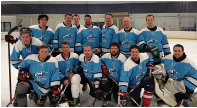
FCA Christian Cup Team picture