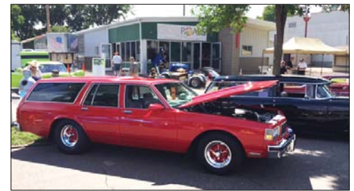
Summer Nationals Car show in front of Crossroads Chapel.

the US; we had no idea. Incredible, right in our back yard. This friend of my dad's invited us all to the Summer Nationals Car show in July to put my Red 1988 Caprice Station Wagon in the show directly in front of Crossroads Chapel.