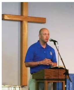
Summer Nationals Car show Sunday morning at Crossroads Chapel giving testimony.

There is another opportunity on the horizon but more to be said on that in the Spring newsletter.