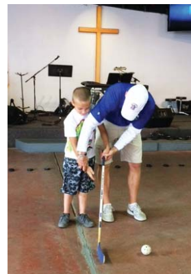
Crossroads Chapel Stick Handling Clinic

beneficial talking to the parents and encouraging them and talking about the HMI hockey camps and the chapel ministry in the MIAC and many people were encouraged with the ministry that was taking place. Almost everyone I talked to didn't know anything like Hockey Ministries International existed.