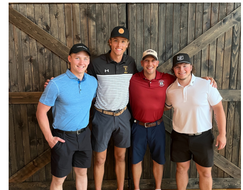
Crossroads Chapel Golf Fundraiser with my St. Olaf and Augsburg leaders

For many, Summer is the time for family vacations, BBQ's and heading to the cabin on the lake, but for me summer is the time for golf and classic car shows. Golf is a great way to connect with current and alumni players who have attended the chapels over the years. I typically play in 2-3 MIAC hockey tournaments each summer. I network and build on past relationships and continue to build new ones. On top of those tournaments, I partner with the Crossroads Chapel at the Minnesota State Fair grounds, and for the last 8 years my dad and I have done car show ministry the third weekend in July at the Summer Nationals. During this car show on Sunday mornings we hold a church service. This year I had been asked to give the message.