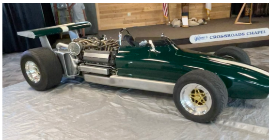
Home built race car by Don Groff, paint and bodywork by Wayne Erickson

Early Sunday morning, we arrived before the fairgrounds were open to the public to set up the chapel for church. First we had to move a race car out of the chapel which was being stored there overnight. We were displaying it outside next to the chapel as a magnificent work of automotive art and a great conversation starter.