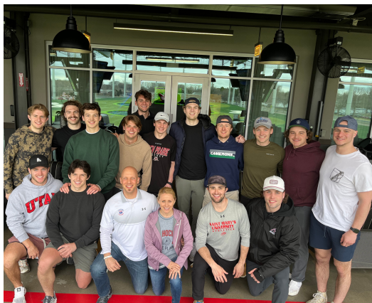
Year End Chapel at Top Golf

Much has happened since the chapel season ended; on April 24th we had our year end chapel at Top Golf in Brooklyn Center. I met with Augsburg, St Olaf, St John's and St Mary's during this past season. Augsburg and St Olaf invited a few players from Bethel and they joined our year-end chapel celebration. Because of the invitation from the Augsburg and St Olaf chapel, Bethel is back on the docket for this fall with a chapel program. Hamline, after not having a chapel this past season due to a coaching change may also be on my chapel schedule. Please pray for a schedule that can accommodate 5-6 teams in the fall on a weekly basis.