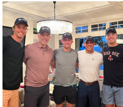
First annual pre-season chapel BBQ

To God be the glory for the good things he has done. We thank God for you and pray for you as you partner with us in sharing the Gospel. Please pray protection over this upcoming school year, who knows what lies around the corner with all the craziness of this world.