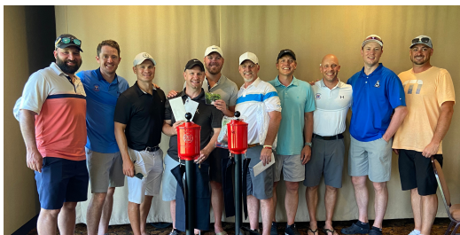
CCGA Golf tournament

A brief snapshot of our summer of ministry and what's happening now. Much of your support goes directly into the hands of chapel attenders, with Biblical tools: such as books, study bibles, Christian DVD's and apologetic resources to handle the skeptical questions of this culture. In June, I was one of two speakers at our annual CCGA Golf Tournament sponsored by IMF. You can view my message at www.isoughtifound.com main page. It also marked our 24th and last year for CCGA.