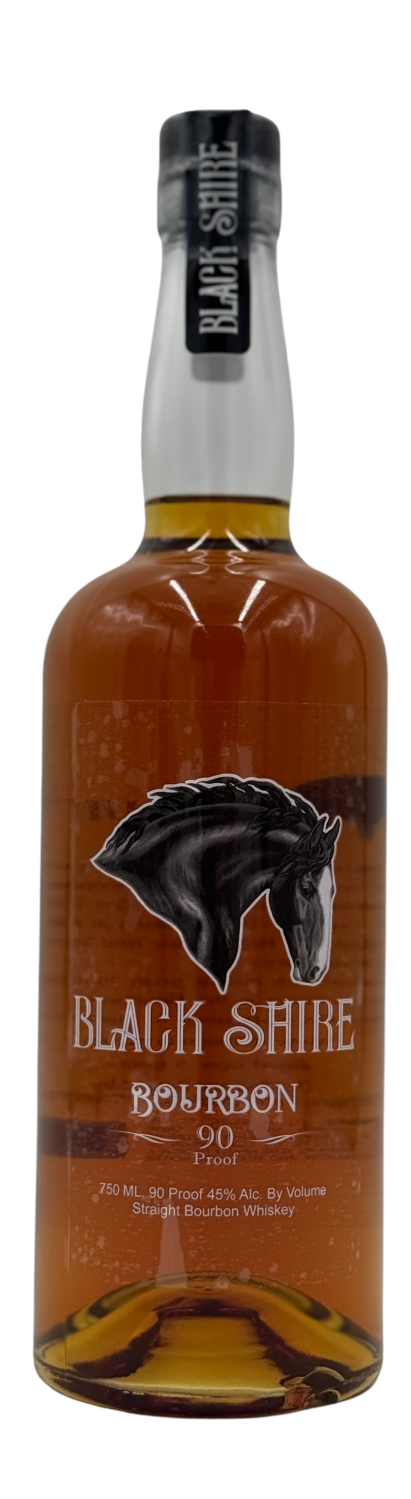
Size - 750ml BTL/CASE - 12

Mash Bill: 75% Corn, 21% Rye, 4% Malted Barley Distilled and Bottled by: Hermann Farm Distillery