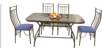
MFD 401 Universal