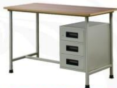
OFFICE TABLE SINGLE 4'X2'

MATERIAL: M.S. C.R. SHEET TYPE OF FINISH: SPRAY PAINTED & POWDER COATED