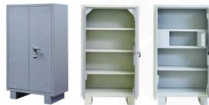
CLOZIT STOREWELL SHELF | LOCKER

MATERIAL: M.S. C.R. SHEET | DIMENSION (INCH): 78" (H) X 36" (W) X 19" (D) TYPE OF FINISH: SYNTHETIC ENAMEL