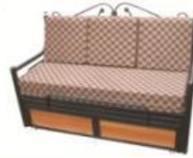
MFSCS 116 Close