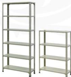
SLOTTED ANGLED RACK

MATERIAL: M.S. C.R. SHEET TYPE OF FINISH: SPRAY PAINTED & POWDER COATED