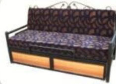
MFSCS 115 Close