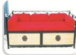
MFB 803 MFDN Regular