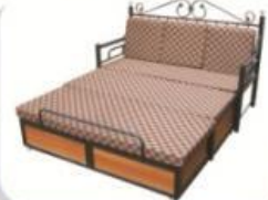
MFSCS 116 Open