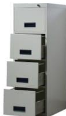
4 DRAWER FILLING CABINET

MATERIAL: M.S. C.R. SHEET & TUBE TYPE OF FINISH: SPRAY PAINTED & POWDER COATED