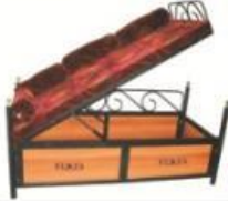
MFDN 306 Hydraulic Storage open