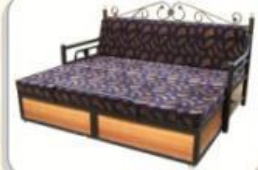
MFSCS 115 Open

Plot No. B-32 A, Kundaim Industrial Estate, Goa. 9881377271 / 9823097703 / 9326102654