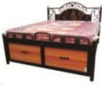
MFB 803 with Hydraulic Storage close