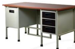
OFFICE TABLE DOUBLE 5'X2.5'

MATERIAL: M.S. C.R. SHEET TYPE OF FINISH: POWDER COATED