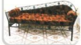
MFDN 303 with out Storage