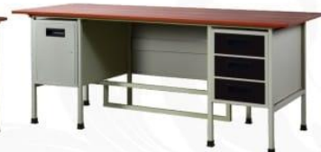
OFFICE TABLE DOUBLE 6'X3'

MATERIAL: M.S. C.R. SHEET & TUBE TYPE OF FINISH: SPRAY PAINTED & POWDER COATED