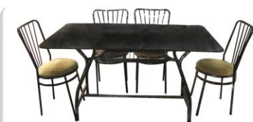
MFD 401 Universal