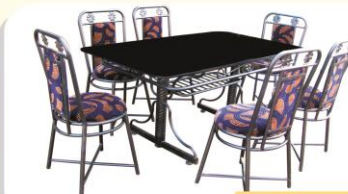
MFD 404 Safari