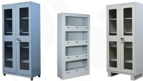
SLIMLINE GLASS DOOR

MATERIAL: M.S. C.R. SHEET | DIMENSION (INCH): 78" (H) X 36" (W) X 19" (D) TYPE OF FINISH: POWDER COATED