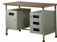
OFFICE TABLE DOUBLE 4'X2'

MATERIAL: M.S. C.R. SHEET & TUBE TYPE OF FINISH: SPRAY PAINTED & POWDER COATED