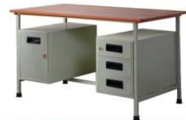
OFFICE TABLE DOUBLE 4.5'X2.5'

MATERIAL: M.S. C.R. SHEET & TUBE TYPE OF FINISH: SPRAY PAINTED & POWDER COATED