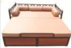
MFDCB 119 Open

Plot No. B-32 A, Kundaim Industrial Estate, Goa. 9881377271 / 9823097703 / 9326102654