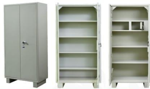
CLOZIT STOREWELL SHELF | LOCKER

MATERIAL: M.S. C.R. SHEET | DIMENSION (INCH): 78" (H) X 36" (W) X 19" (D) TYPE OF FINISH: POWDER COATED