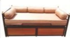
MFDCB 119 CLOSE