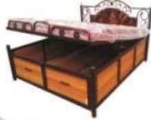
MFB 803 with Hydraulic Storage open