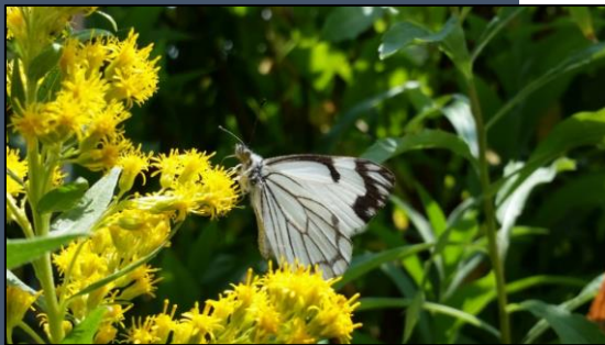
Many butterfly species nectar on a variety of plants, but lay their eggs on a select few. This Pine White is drinking nectar from Canada Goldenrod, but its caterpillars only eat needles from trees in the Pine Family