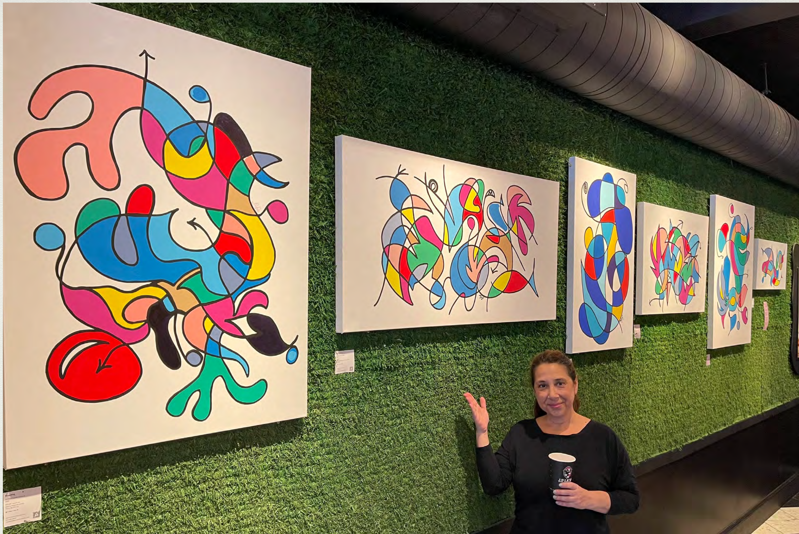
Visiting Artist Exhibit at JP Licks, Wellesley