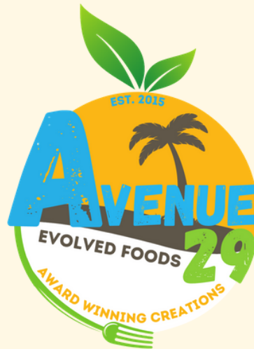
Founder - Award Winning Chef & Meatless Marketer