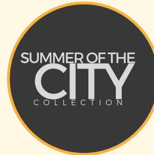
Founder - Cause-Based Apparel Line