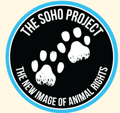
Founder - Animal Rights Activist - Donor & Rescuer