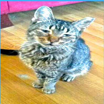
Soho, rescued Nov 2014 In Loving Memory

That's why we rely on great sponsors like you to help offset our costs so we can fund more rescue missions all across the globe.